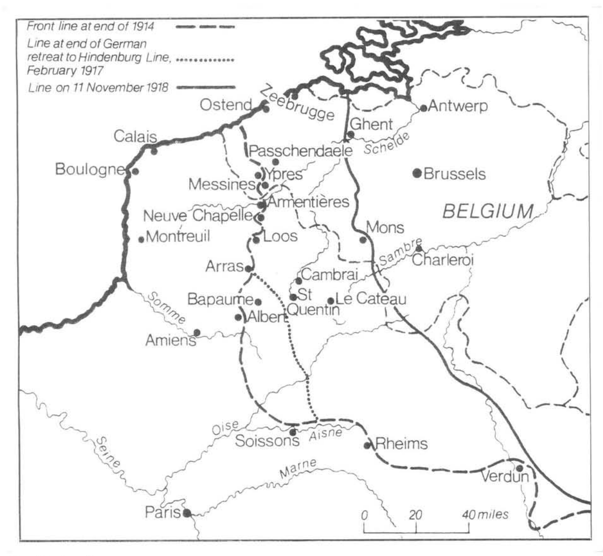
The Western Front

M. Brown, The Imperial War Museum Book of the First World War, London, Sidgwick & Jackson, 1993, p. 285