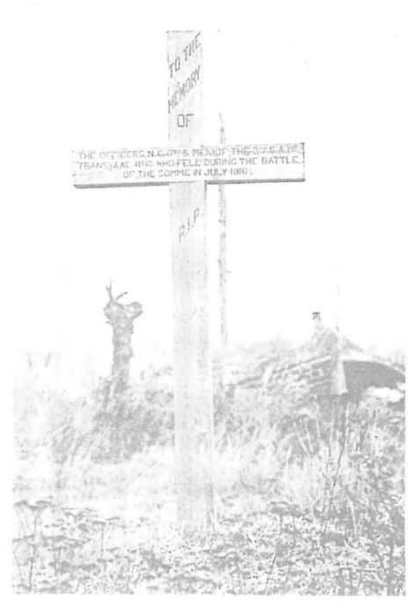
The cross commemorating the men of 3 SAI Regiment who fell during the Battle of the Somme, July 1916

The Ninth Division lost 314 officers and 7 203 men from 1 to 20 July but the South African Brigade suffered more than the other two Brigades. Fighting in the wood continued until 8 September 1916 when the last Germans were driven out. This is an indication of how difficult it was to take and hold Delville Wood.<sup>24</sup> After Delville Wood the war was not over for the South Africans. Three months after their ordeal at Delville Wood they fought at the Butte de Warlencourt and suffered more than 1 100 casualties. After this the South Africans fought at various places including Arras, Fampoux, Ypres, Moslains, Gouzeancourt, Marrières Wood, Rancourt. The Battle of Lys, Messines Ridge, Wytschaete, Reumont and Le Cateau. When the ceasefire took effect on 11 November 1918 the Brigade held the eastern most position on the Western front. From April 1916 to November 1918 nearly 20 000 South Africans took part in the campaign on the Western Front. Just 6 000 of these were not casualties. On all fronts South Africa put more than 136 000 troops in the field (the fourth most of all British Dominions and colonies, including India). Of these nearly 7 000 were killed and more than 11 000 wounded and captured. More than 107 000 Blacks, Indians and Coloureds took part as labourers, transport drivers and wagon-leaders and of these more than 4 000 were killed.25