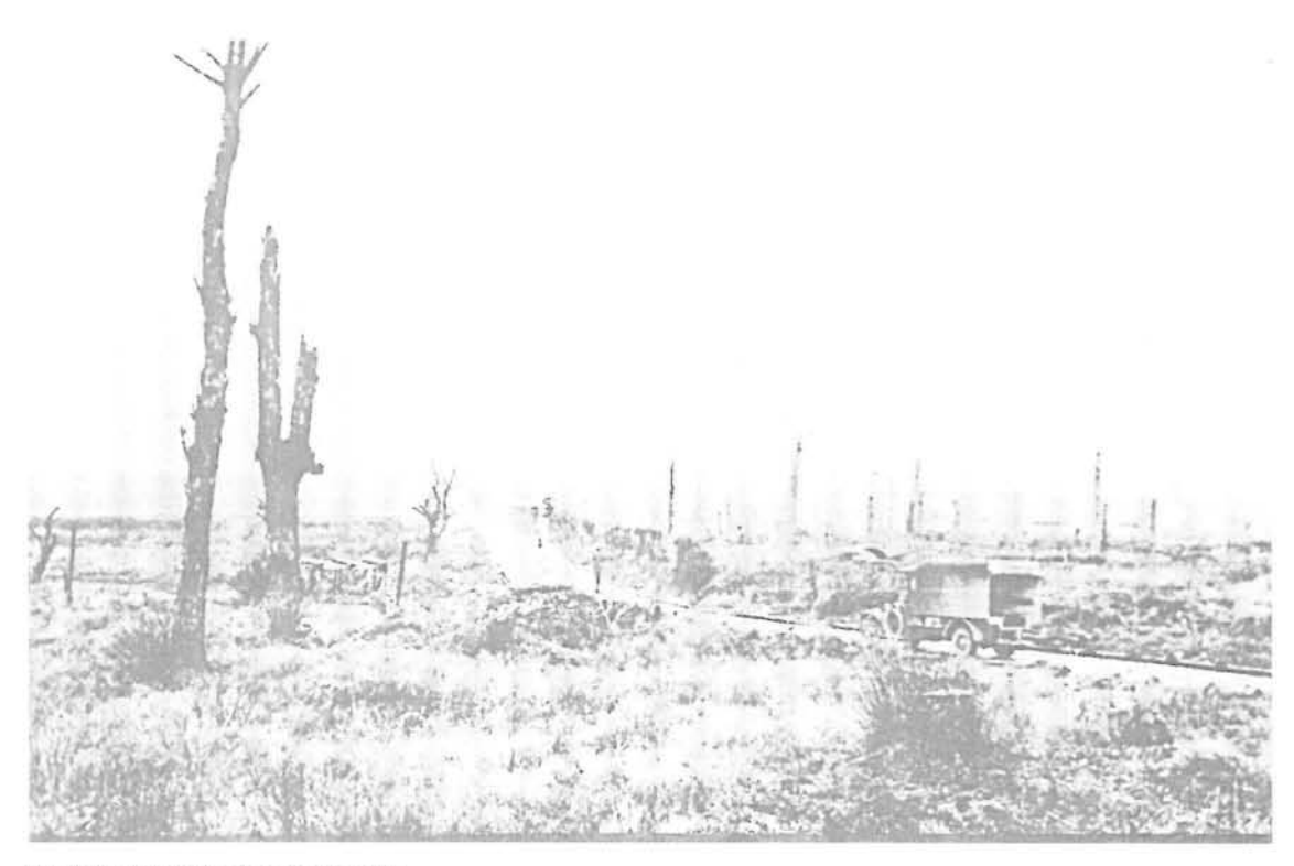
Delville Wood after the battle