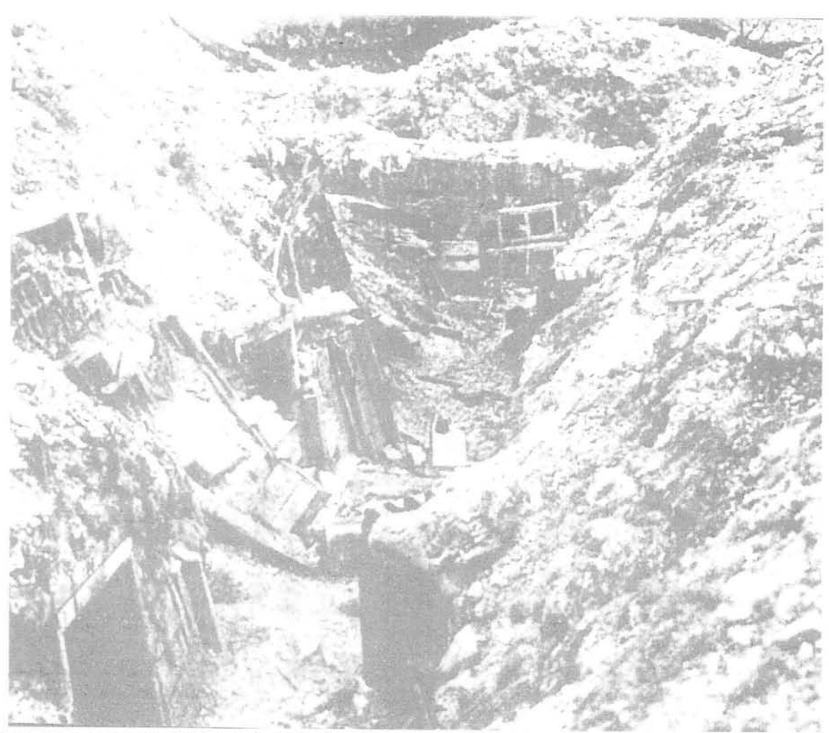
The scars of war. A dug-out in Delville Wood