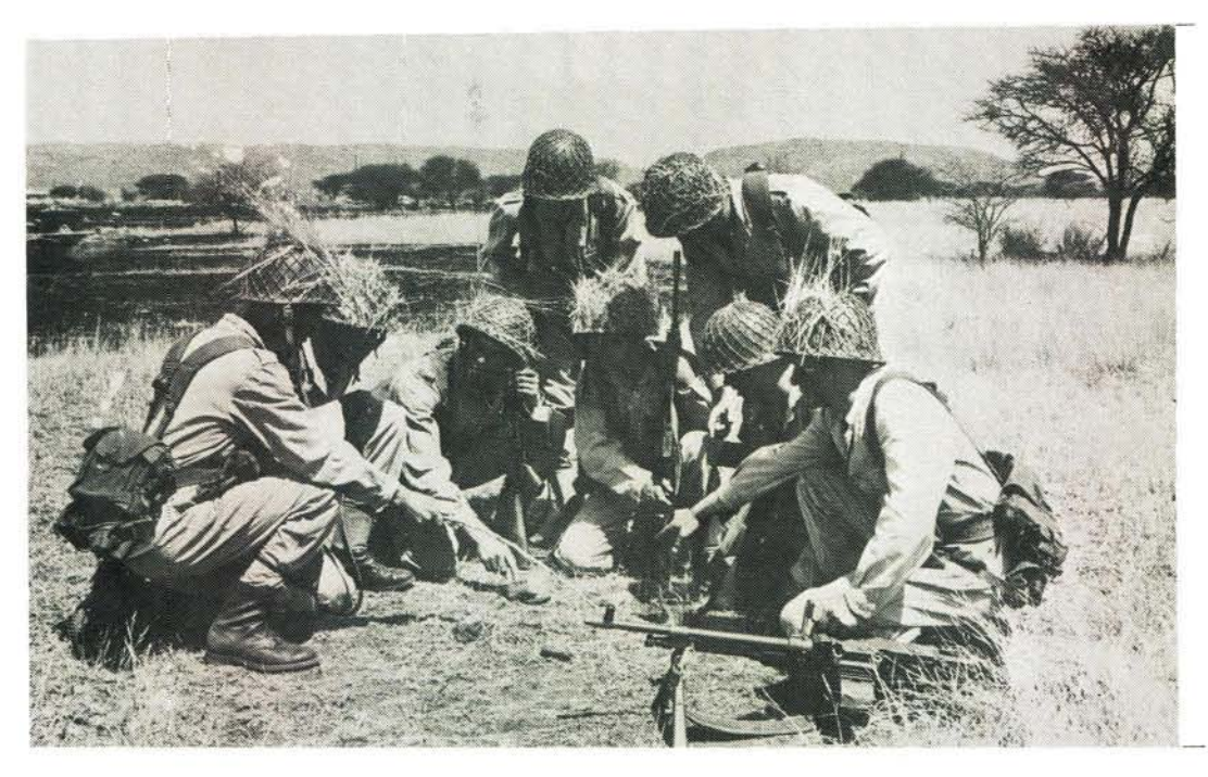
Veldopleiding van die SP Wag The State President's Guard undergoes field training