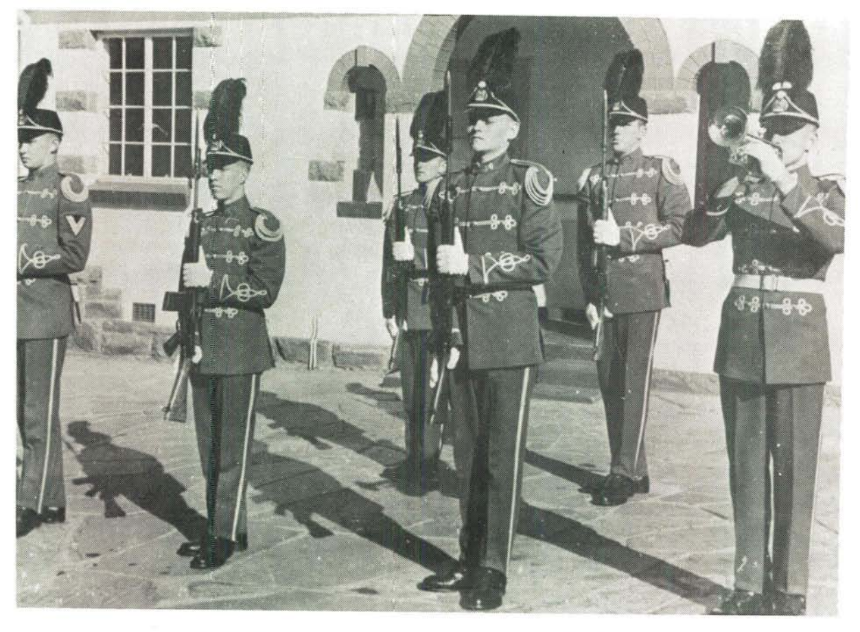
Wagwisseling van die Staatspresidentswag voor die Presidensie Changing of the guard in front of the Presidency