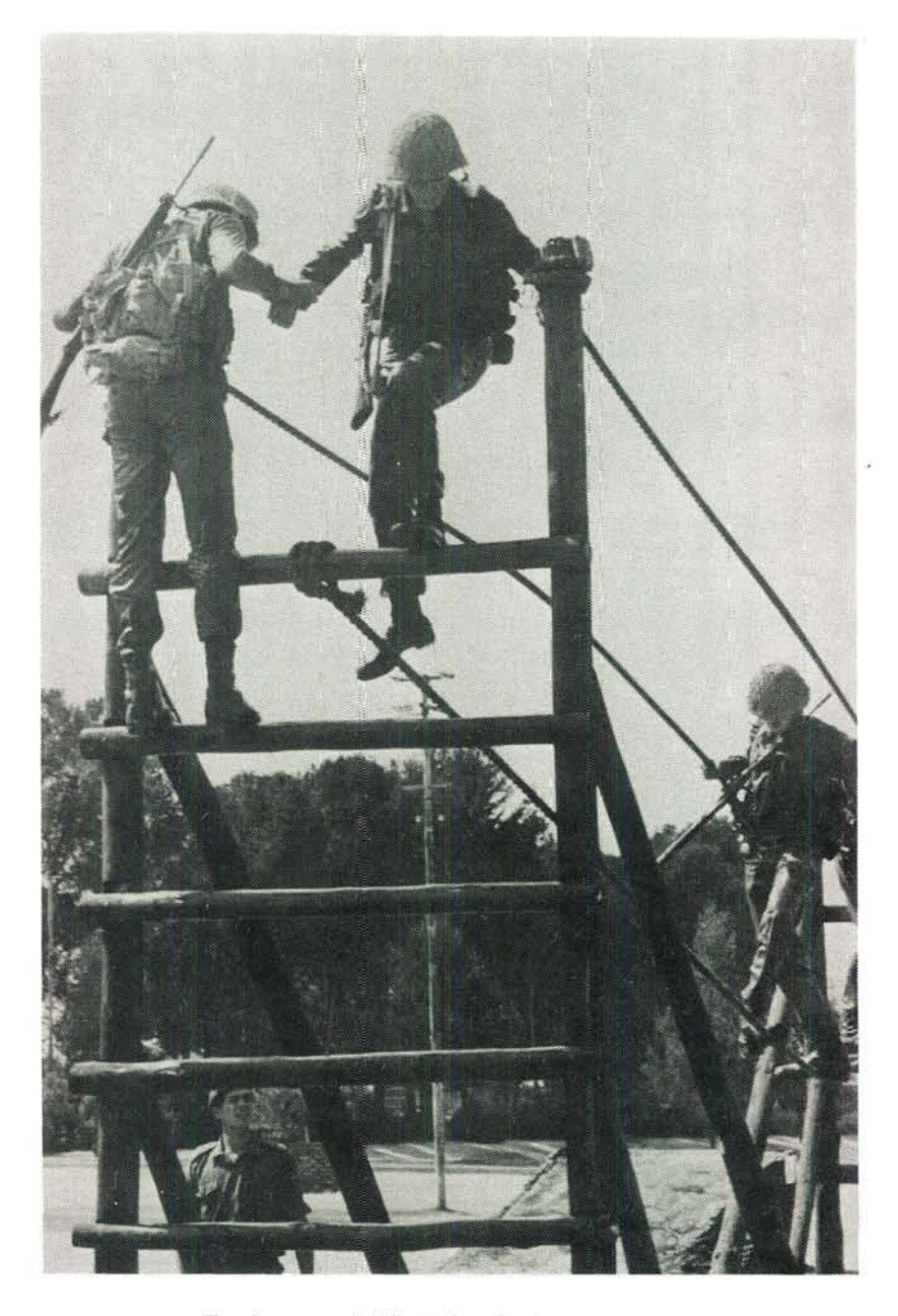
Tou-loop en pale klim tydens basiese opleiding Rope-walking and pole-climbing during basic training

the State President's Unit are demanded. These include an average of 190 points in the Chief of the Army's shooting competitions; a fitness standard of 75%; a maximum number of accident-free kilometres; irreproachable loyalty towards the SADF; and a high standard in ceremonial work.