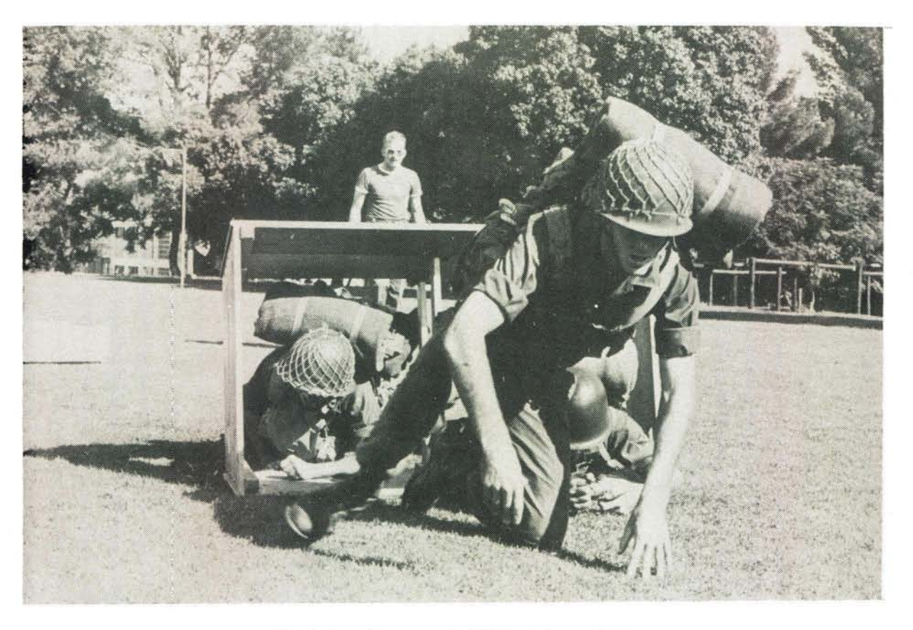
Hinderniswedloop van die SP Wag tydens opleiding An obstacle race: part of the training of the State President's Guard