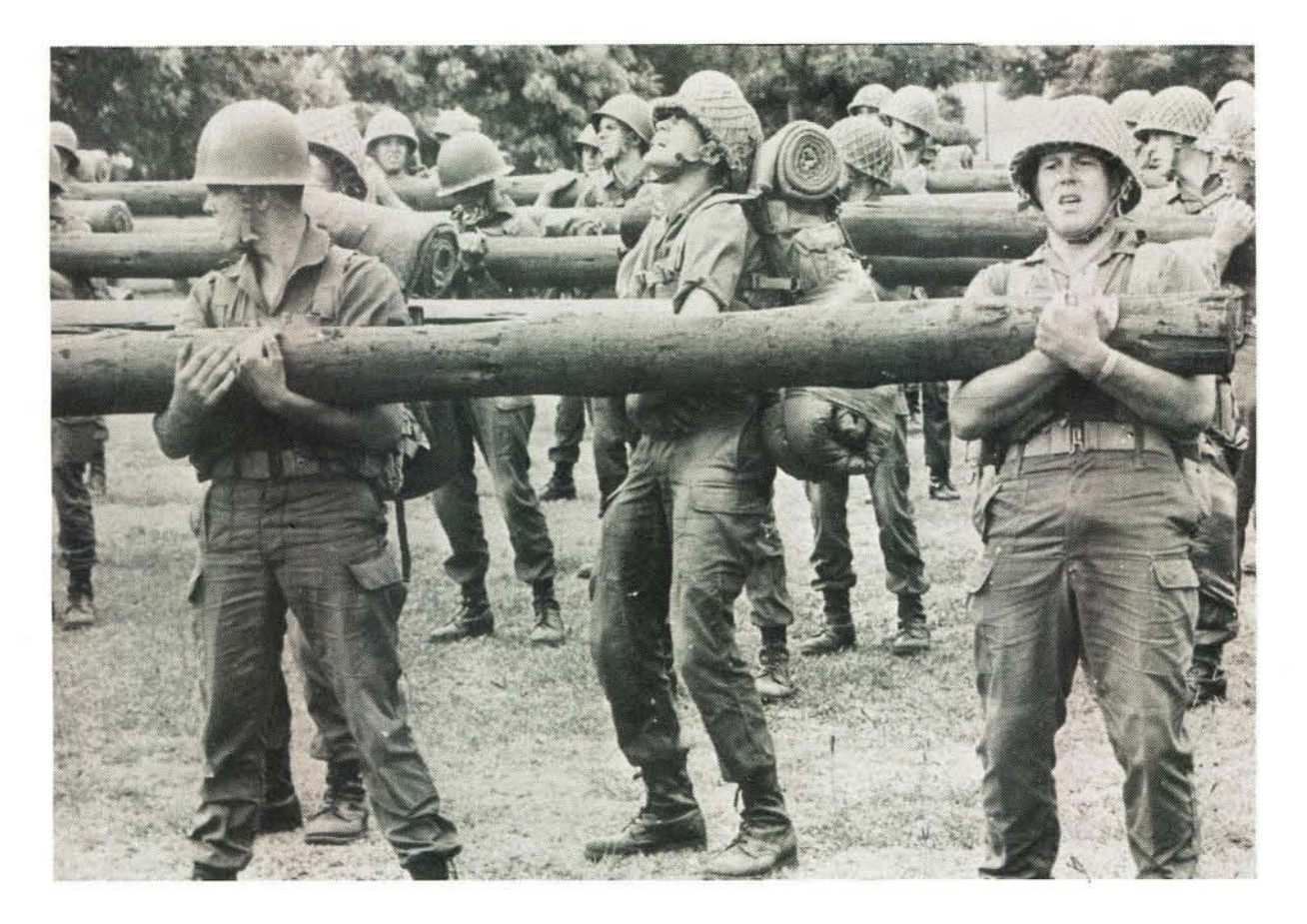
Oefening met pale deur lede van die SP Wag Members of the State President's Guard exercising with poles