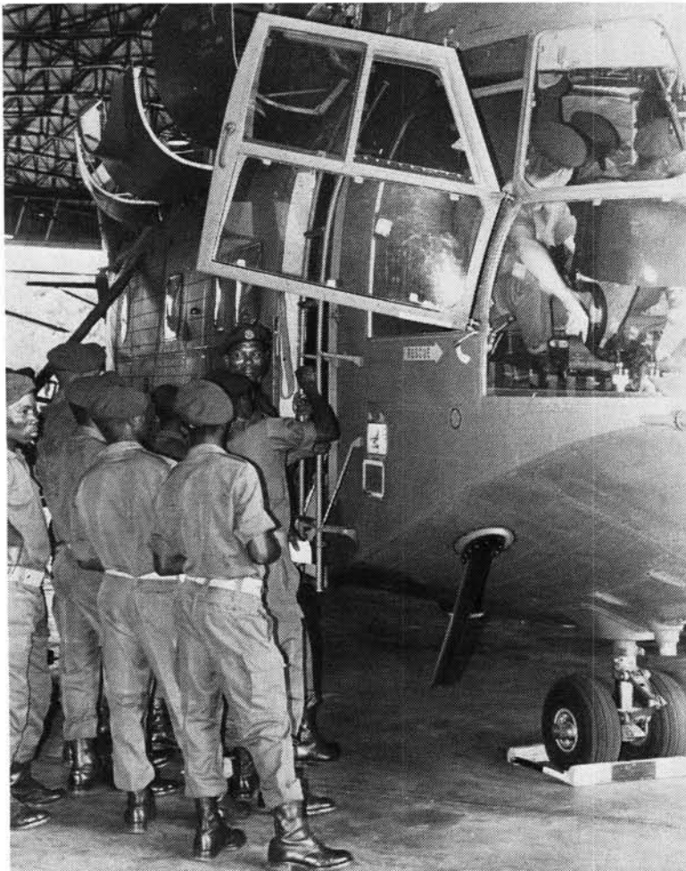
21 Battalion looking at a Frelon helicopter

At this stage infantrymen form the largest component of black personnel in the South African Army although Blacks are employed in a number of other musterings.