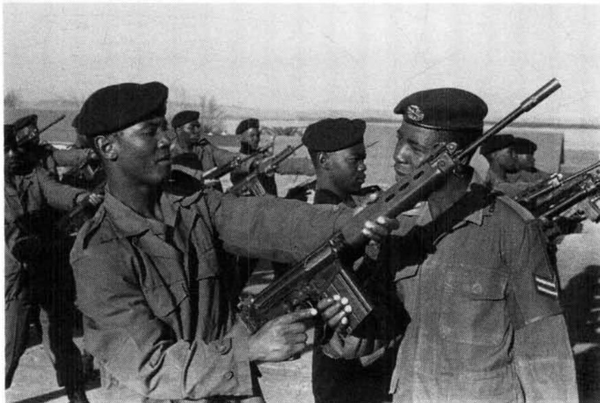
Black members of the SADF busy with weapon-training

During 1982 the training took place with the formation of five wings namely a regimental wing, a service wing, an infantry wing, a counter-insurgency wing and, a catering wing. During 1982 21 Bn also received their unit flag. One of the highlights of 1984 was when they received the Freedom of Soweto. The highlight of 1984 was when the first two Black officers of 21 Bn were commissioned with the rank of Lieutenant. The prime function of 21 Bn is to train Black soldiers for the SA Defence Force and for the National States.