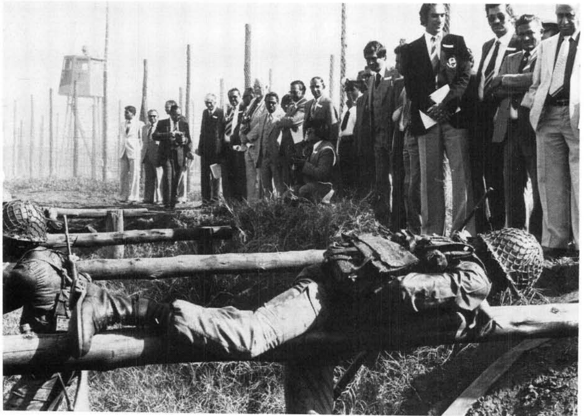
As many men and much equipment as possible are used to make it possible to negotiate an obstacle in the given time

Coloureds make up 9,5 per cent of the Permanent Force strength, and 16,5 per cent of civilian female workers in the SADF are Coloured.