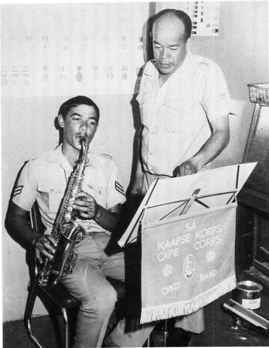
Members of the Cape Corps orchestra preparing for a performance

It is interesting to note that the majority of this contingency have specifically applied for active service in the Operational Area.