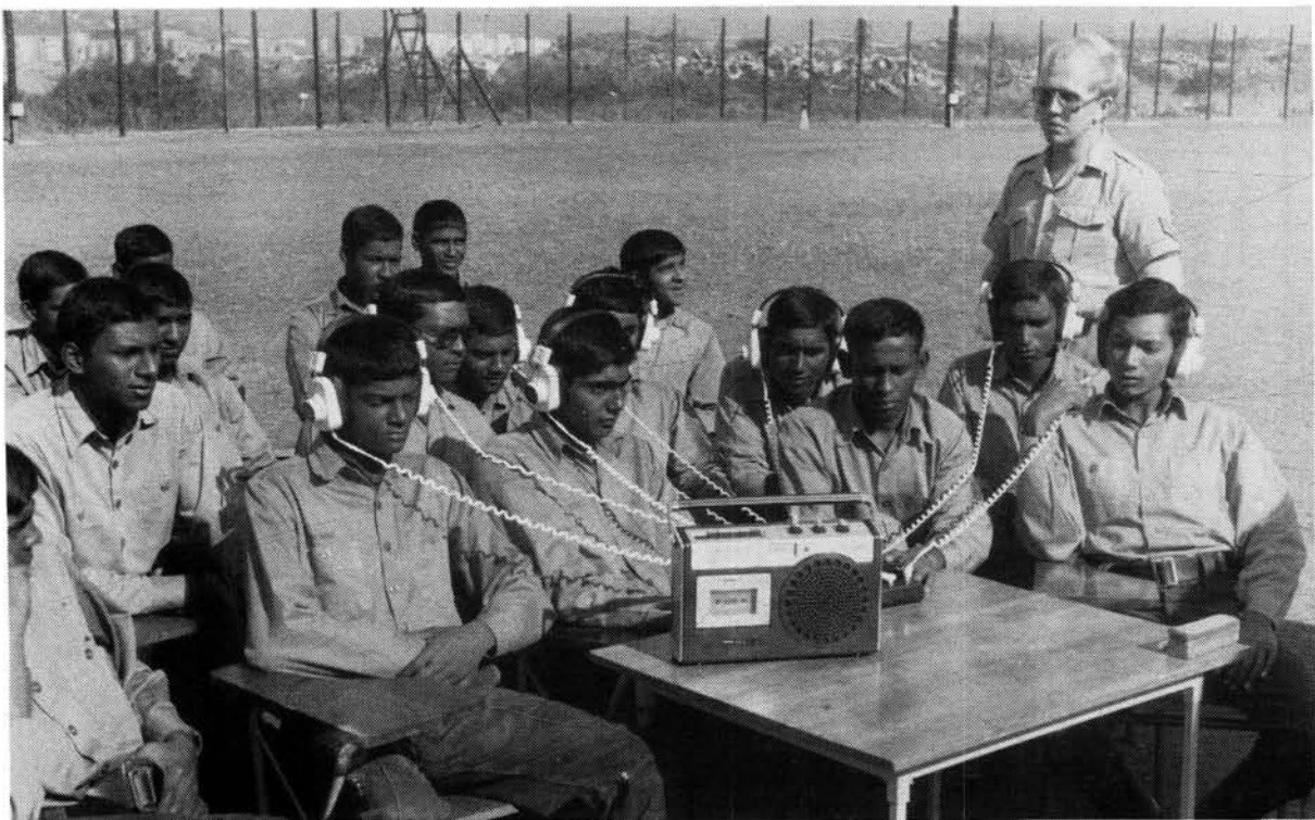
All the Indian members undergo a course in radio communication

In November 1973, the establishment of a training centre for Blacks was authorized by the Chief of the Army. On 21 January 1974 the unit was activated when 16 volunteers presented themselves for basic training at the Prisons Services Training College at Baviaanspoort near