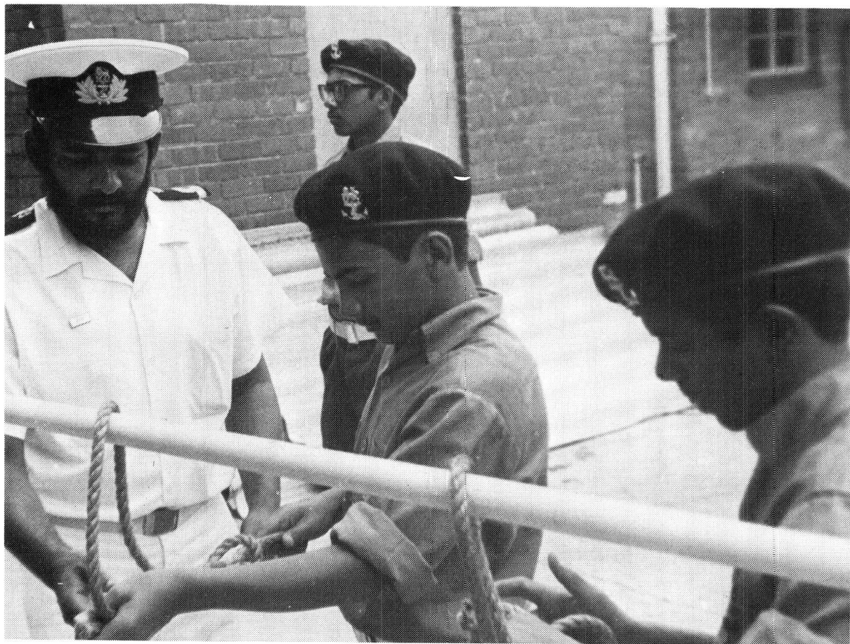
The members learn how to tie knots in a record time