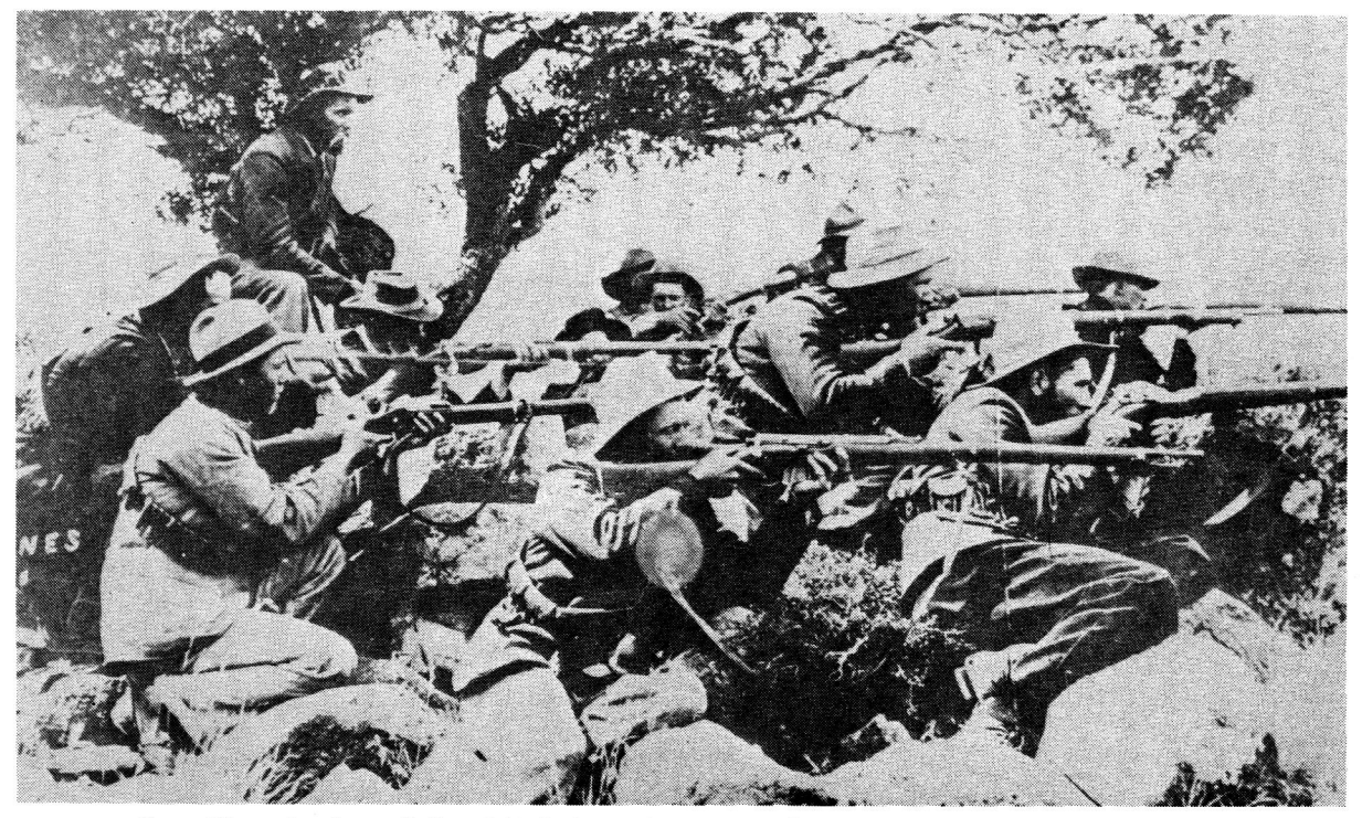
Boer Sharpshooters distinguished themselves as excellent shots during the Anglo-Boer War

During the Anglo-Boer War of 1899–1902 our forces, for more than three years, held at bay the most powerful Empire the world has yet seen. We did so because we could outshoot their troops and out-general their generals – and because in the 7 mm Mauser rifle, even without benefit of telescopic sights, we had the advantage of a superbly accurate, flat-shooting weapon. Had this not been the case, the war would have ended for us in ignominy and disaster. Our ability to use the rifle as it should be used spared us from ignominious defeat and preserved our pride. It also paved the way for eventual political victory.