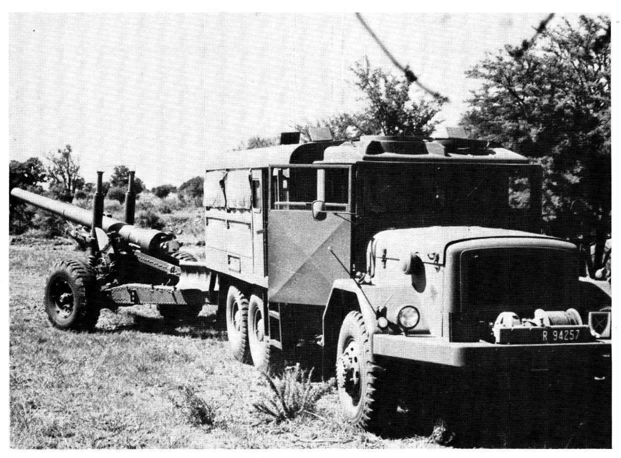
Alternative methods of towing the 140-mm gun. (above) – Marguris Deutz. (below) – Samil 100