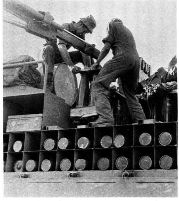
Projectile pallets being loaded