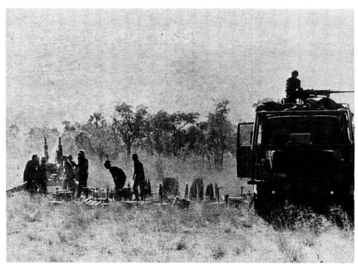
A 140-mm gun in action

South Africa has always been highly respected in military circles for the quality of its manpower and, in the long-run, (when all is said and done) is this not the crux of South Africa's answer to any weapon deficiencies?