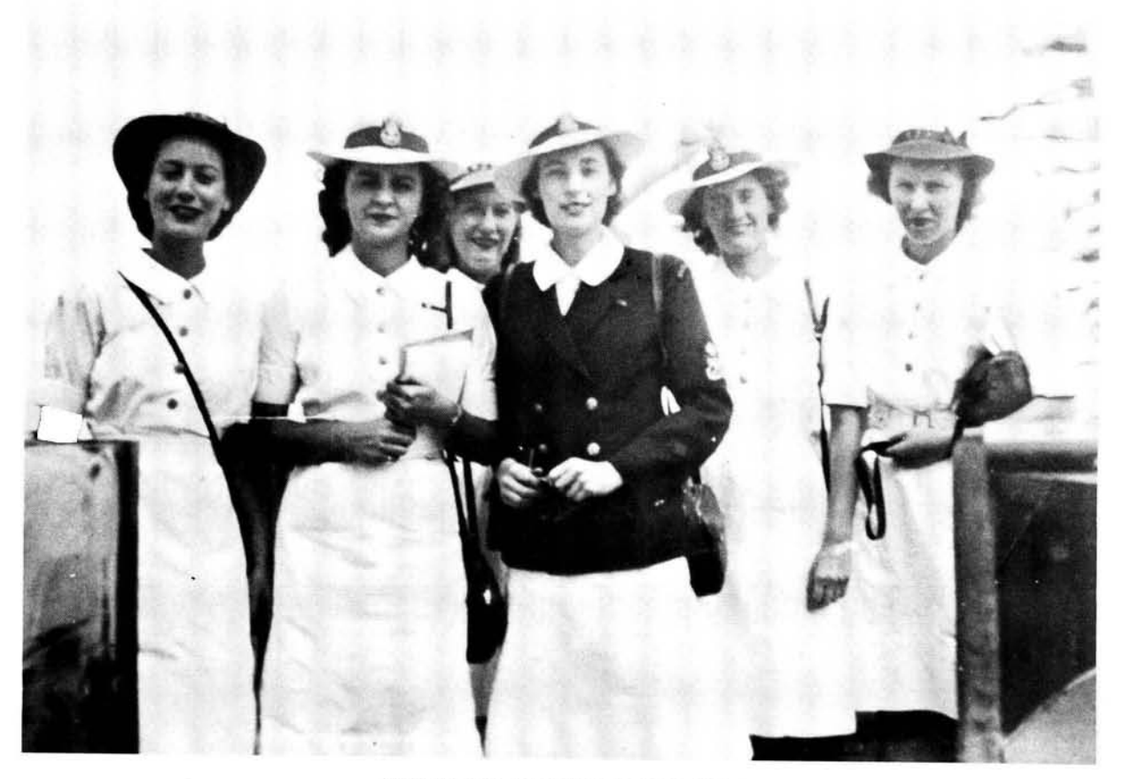
SWANS visit HMS VANGUARD in 1947.

Although some attempts had been made to create a naval uniform with a uniquely South African identity, it was the Hon F. C. Erasmus, Minister of Defence 1948-1959 who made the greatest single contribution to the achievement of this goal. The wartime orange diamond mentioned above was retained after World War II. In the Army and SA Air Force it had sometimes been the cause of discord so it was understandable that it