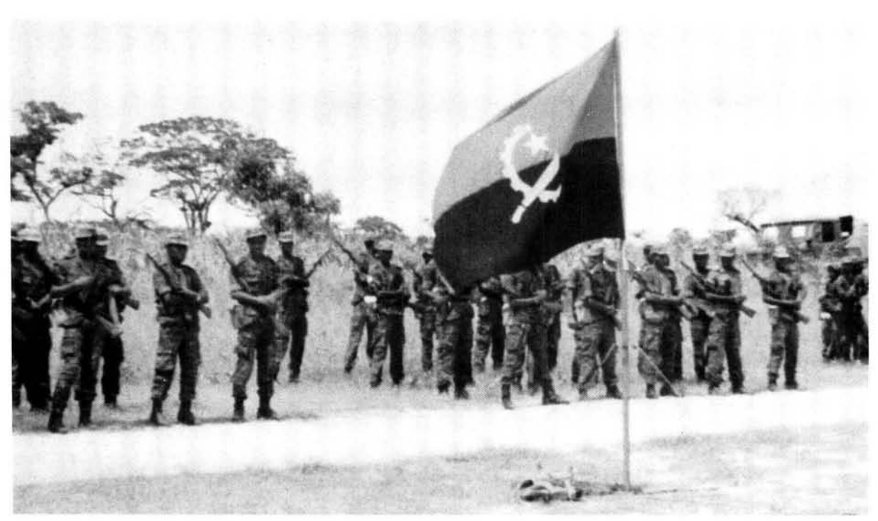
On 1 March 1984 a JMC parade was held at Cuvelai Airfield. Troops of both parties with both the RSA and Angolan flags were on parade.

The Fapla JMC component agreed to immediately have all Fapla patrols recalled from south of the monitor line and also accepted that the move to Mupa could not take place on 7 March as planned. 12 March was provisionally agreed on as the new date if the situation had improved by then.