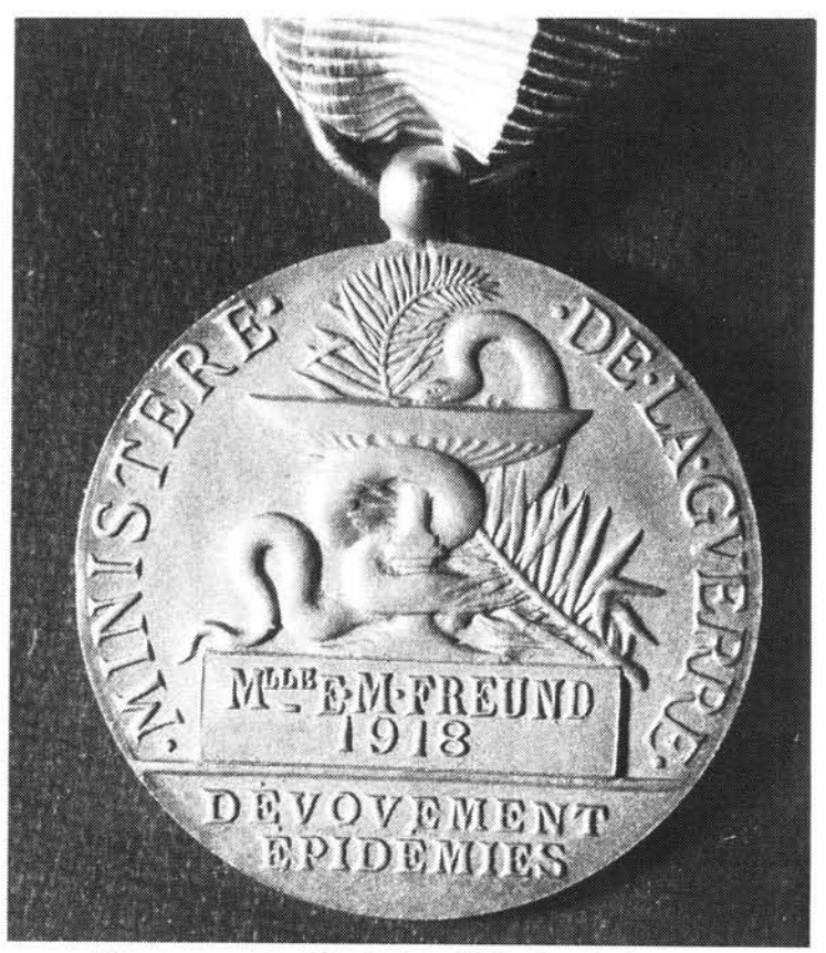
The reverse side of the Medal, with the inscription