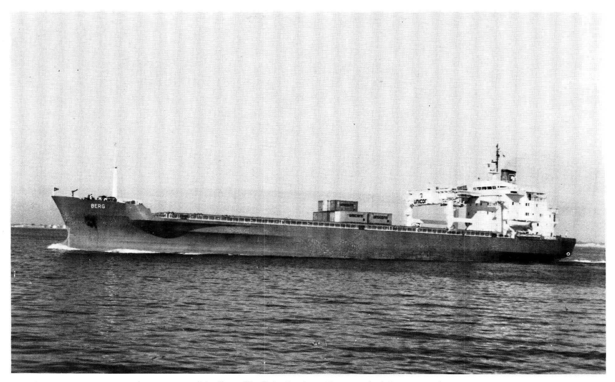
The South African coastal container ship 'Berg' built in Durban. Removal of the movable gantry crane and level stack of container modules gives rise to a large number of useful naval roles, not the least being a flexible helicopter capacity.