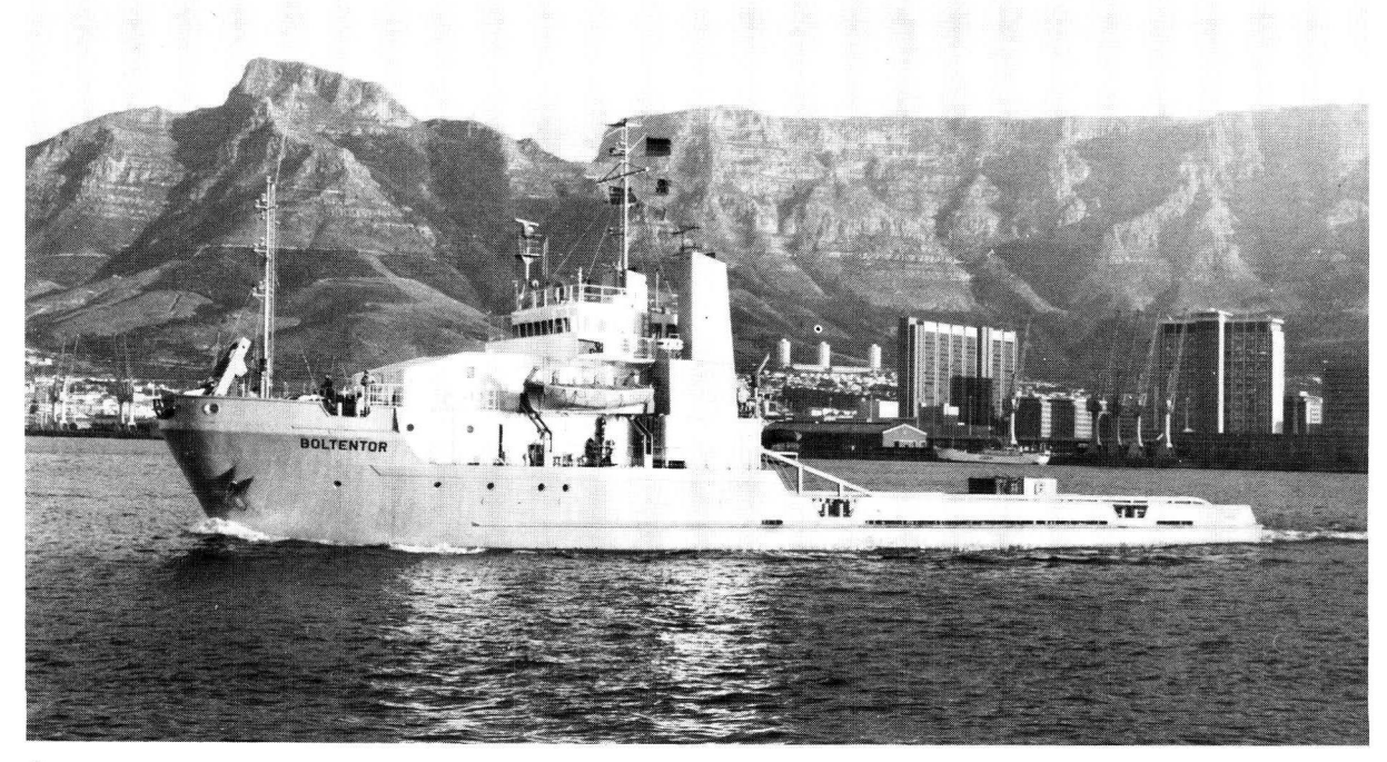
German oil rig supply ship 'Boltentor', of a type previously constructed in Durban. A low afterdeck, high maneouverability and good turn of speed makes this type of ship readily convertable into a large number of naval roles.

It is thus possible to construct portable radio shacks, radar and operation rooms, sickbays, galleys, workshops etc. The tops of the containers themselves give a level and open surface which could readily be made usable as a flight deck. The various modules commensurate with the ships role could be stored ashore until needed and then rapidly placed aboard and literally plugged in to the ships previously adapted power supply. A large sea-worthy patrol ship of this nature capable of steaming rapidly to a point and then doing a slow speed deployment could