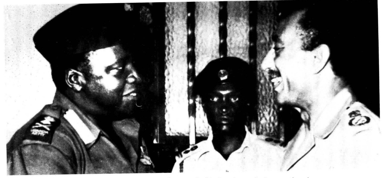
President Idi Amin of Uganda and President Sadat of Egypt.