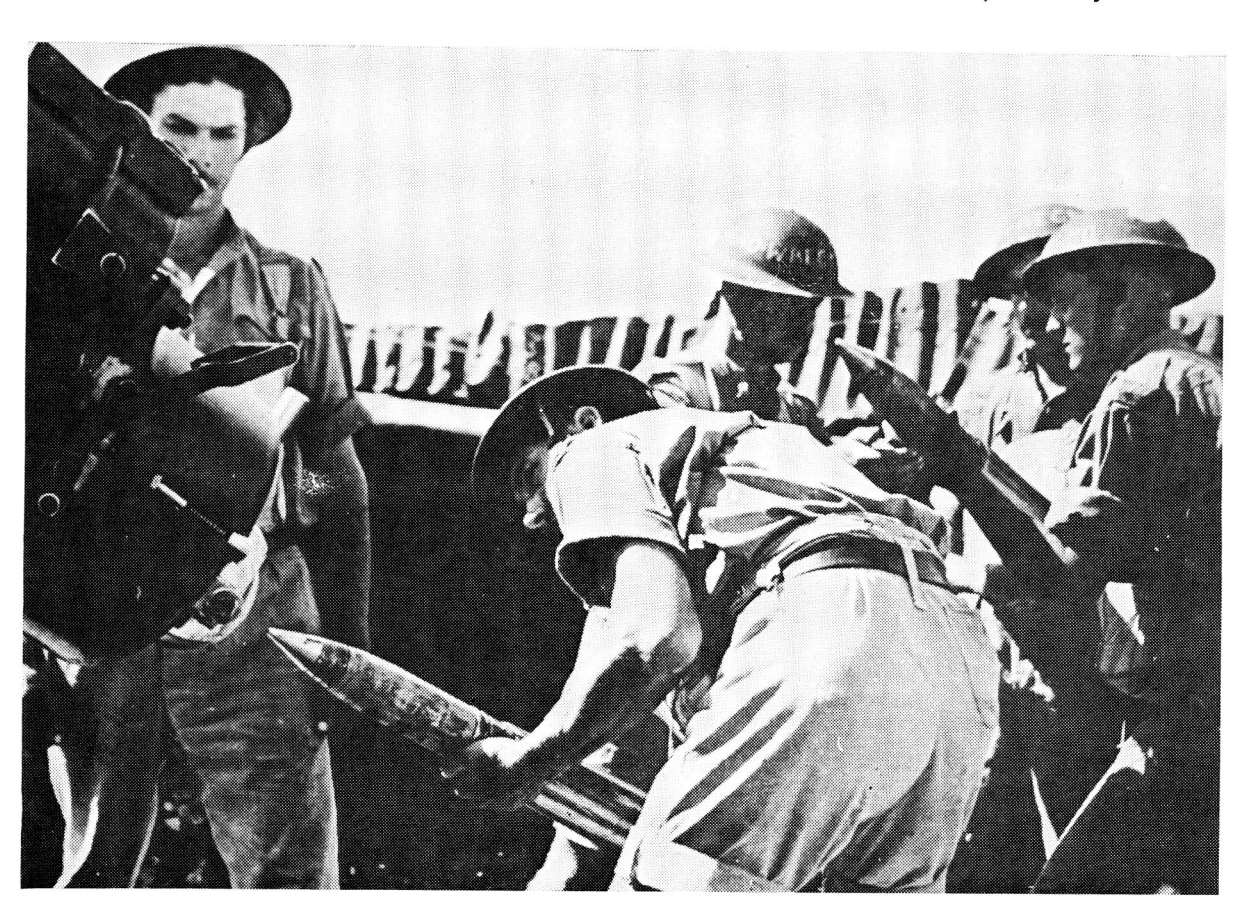
South African gunners loading a 3,7-inch gun in East Africa.

a. The dual authority over AA was to be reconsidered and either Director Field Army Artillery or Coastal Defence was to take over full responsibility.