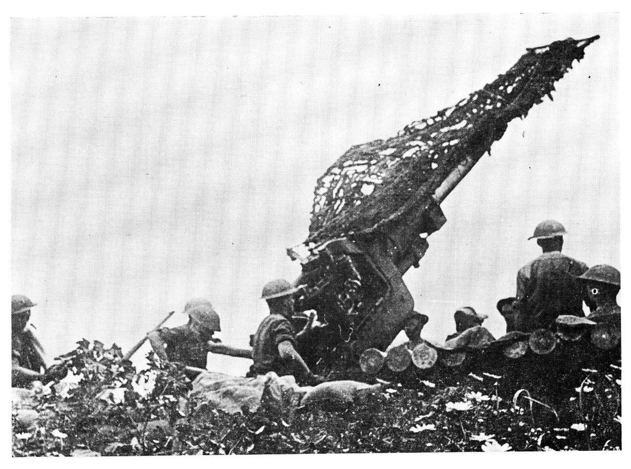
Camouflaged 3,7-inch position in North Africa prepared for action.