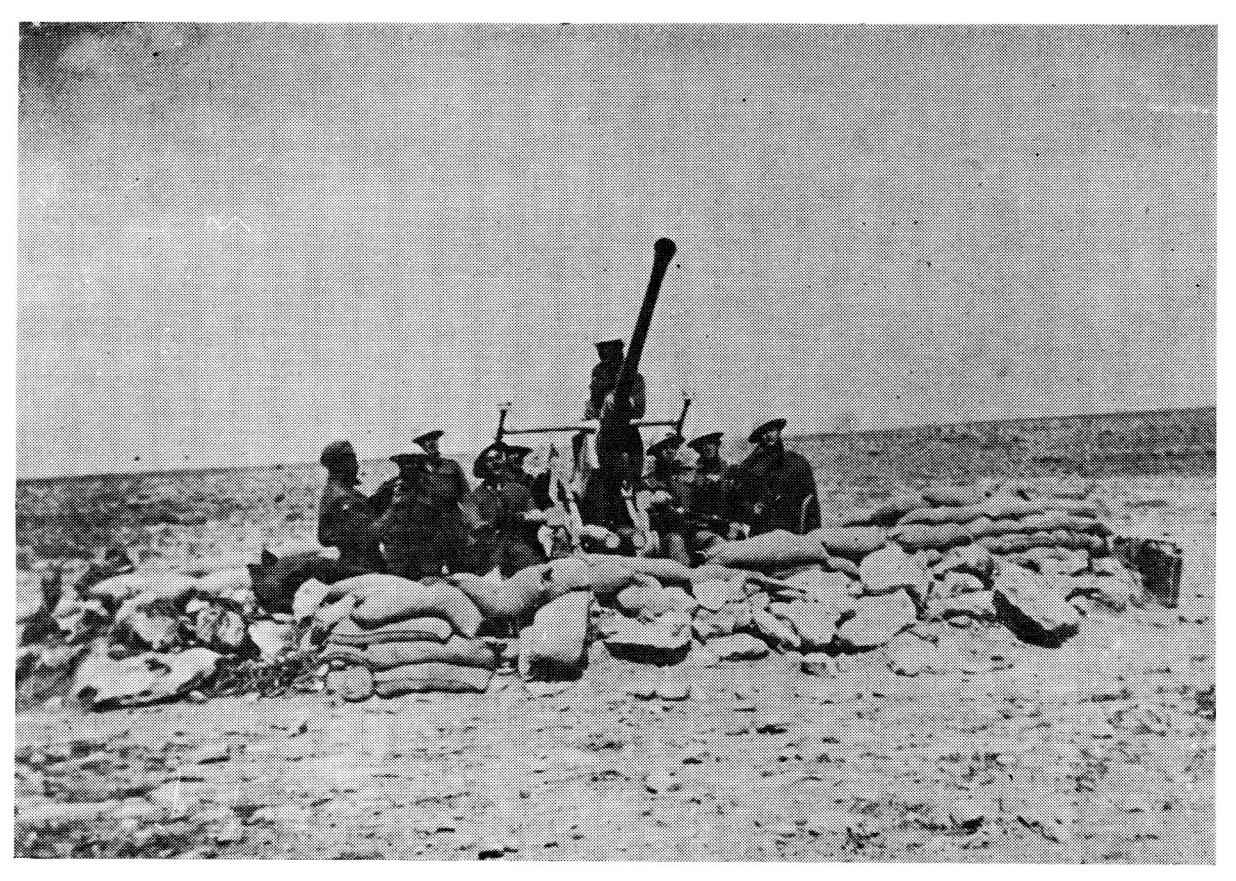
1 SA Division Headquarters, Gazala Line 1942, a South African manned Bofors-gun position.

bers were later changed to number from 50 to 55.)