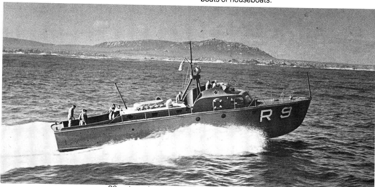
R9 – last of the Miami boats to leave the service.

Many of the boats became fishing boats, pleasure boats or houseboats.