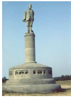
Illustration 3. Monument for Christiaan de Wet, De Hoge Veluwe, Otterloo, the Netherlands.

Apparently, the Dutch needed such images of moral force much more than they needed objective historical reality, or a narrative of the real war. In this sense, the military leaders of the Afrikaners in the Boer War were objects of admiration and commemoration. Holland remembered the moral and spiritual virtues behind the concrete persons, events and battles, such as balance, resolution, courage, force and even attachment to peace. Obviously, the famous Dutch sculptor Joseph Mendez da Costa (1863–1939) designed the monument of De Wet with this in mind, as a set of “Dutch” values carved in stone.