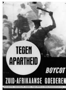
Illustration 1: Protest against apartheid in the Netherlands after 1960.

Secularisation and the ontzuiling (de-pillarisation) of Dutch society did the rest. Especially within the Protestant communities, South Africa had been popular. In these circles, the paternalistic notion of a white roeping (calling), the ideal to bring Western civilisation to the black communities and thereby educate them, as well as the acceptance of different tempos/directions of development, had all been strongly applauded. It was also here that the idea of stamverwantschap (kinship) had been cultivated (the idea of religious and language kinship, and the notion of an interrelated Dutch and South African history). With the secularisation of the Dutch society, from the sixties onwards, these old meta-narratives, as well as the groups that supported them, started to lose their aura of being self-evident.