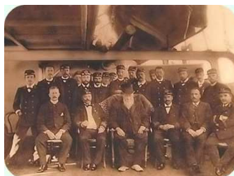
Illustration 2. President Kruger “rescued” by the Dutch, on the cruiser HNLMS Gelderland.

Until the Jameson Raid, the Dutch considered the Boers to be lazy, inflexible, narrow-minded, primitive, reactionary, intolerant, bigoted and bearded, something Dutch liberal citizens certainly did not want to be themselves. Around 1900, however, the Boers were celebrated as a pious and freedom-loving people, surrounded by hypocritical Englishmen, black devils, and a godforsaken natural environment. Especially during the years of the Boer War, no limits were set on this positive value-oriented image. Numerous pro-Boer movements were now formed, many petitions signed, sympathy statements written, money raised for ambulances, and the right of the Boers to freedom and independence was asserted everywhere. The Boers were described as a simple and honest people who had put their trust in God, a chosen people living in a desolate wilderness sent to build civilisation out of nothing, and fighting bravely against natives and the English armies alike. “They were the pioneers of Christianity and civilisation,” as the then very famous but now rightly forgotten Dutch author Louwrens Penning (1854–1927) claimed. 8 His novels (typically all written before he managed to visit South Africa) featured Boers bravely fighting for freedom and justice, “with a psalm on their lips and armed with gun and Bible”. 9 After 1880, and even more so after 1899, this image became almost undisputed in the Netherlands. 10