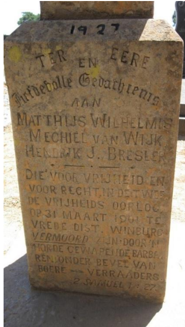
Figure 2: The Boer memorial in the Theunissen cemetery

The monument in Winburg with the names of the Boers who died during the South African War was erected to commemorate their heroism. The monument therefore honours heroes, with the focus on the people who fought, and aims to remember their heroics in perpetuity. 7