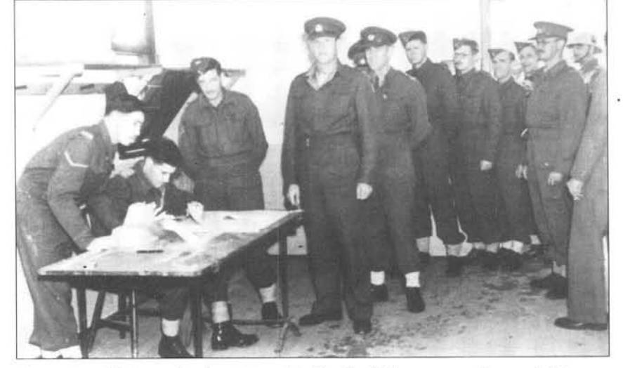
The 'voting parade' at Pollsmoor, 1943.

politically and organisationally, changes in political demography that favoured the Afrikaners (especially the faster birthrate) and a generational factor whereby the older UP-supporters died and a new generation of more