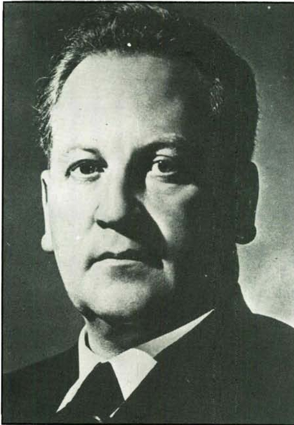
Adv F.C. Erasmus, the first Nationalist Minister of Defence.

Erasmus was determined to establish a South African character in the UDF. During this process, especially during the period 1948-1955, he introduced several far-reaching changes into the Defence Force. It was thus not very long before the new nomenclature policy received a thorough test run and many prestigious old units were