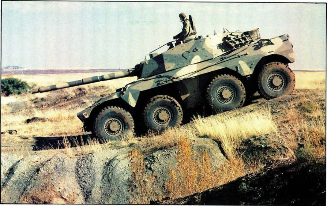
The name Rooikat was chosen for this armoured vehicle after the Army's application to name it Cheetah was turned down.