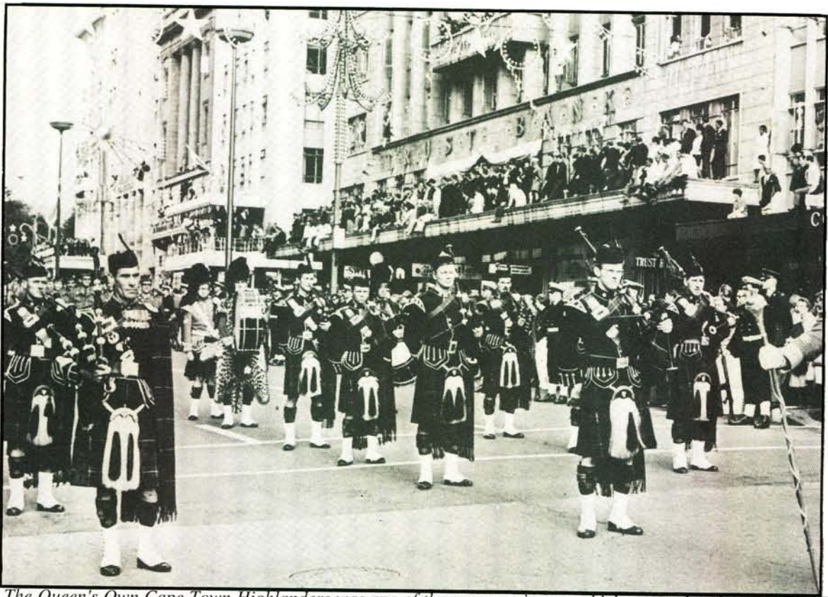
The Queen's Own Cape Town Highlanders was one of the many regiments which was ordered to change its name in 1961, when South Africa became a republic.

addition to the policy was the categorising of names in order to prevent duplication and maintain consistency. In other words, categories were set up from where names could be chosen, but each category was reserved for a different purpose. For example, one could not select a name for a ship from a category earmarked for submarines and so forth. Themes and not the names themselves, were provided in the categories so as to allow for a certain measure of flexibility. For instance the SA Navy's Strike Craft may be named after previous ministers of defence.