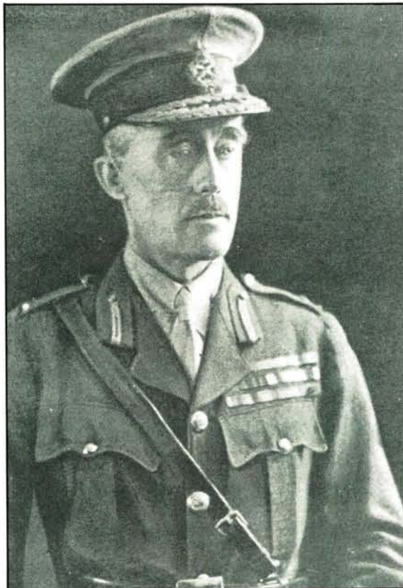
Brigadier General J.J. Collyer, Chief of Defence Staff.

formed. Regiments in existence prior to the founding of the UDF were allowed to keep their original titles. However, notable exceptions in this case are the official units and corps of the former ZAR and OVS republics. These were absorbed straight into existing UDF regiments and, as a result, lost their titles and often their original functions. The Staatsartillerie of the two Boer Republics provide a good example, both were absorbed into the South African Mounted Rifles. 6