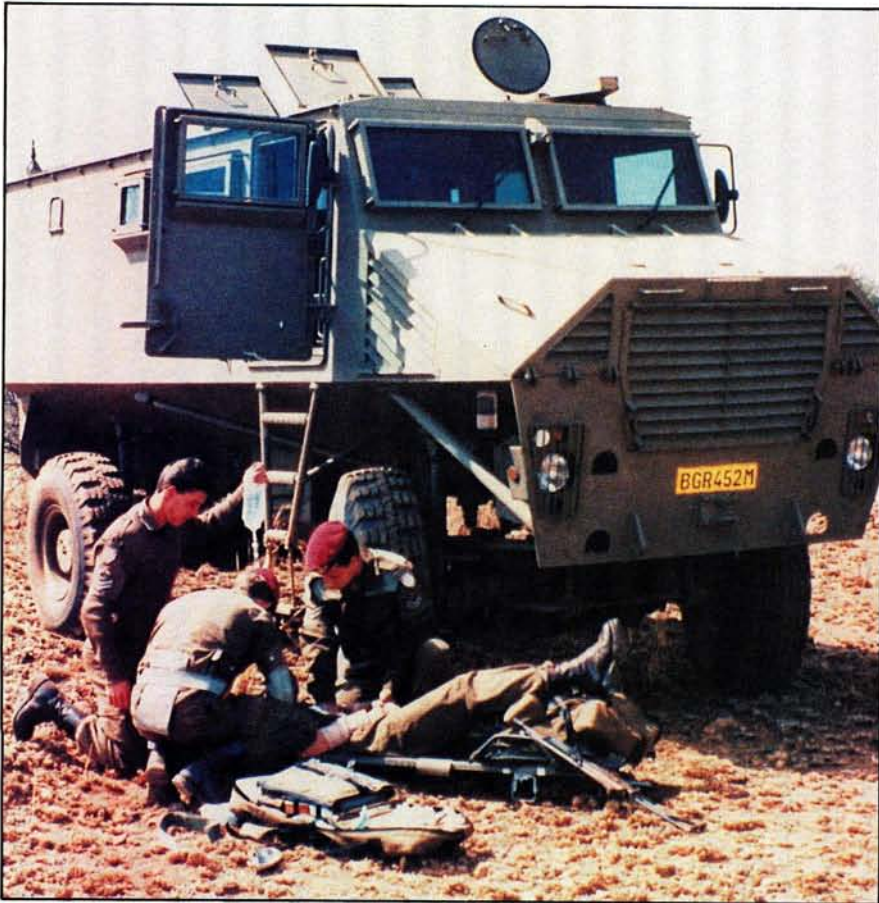
The Mfezi is a mine protected ambulance in service with the SAMS.