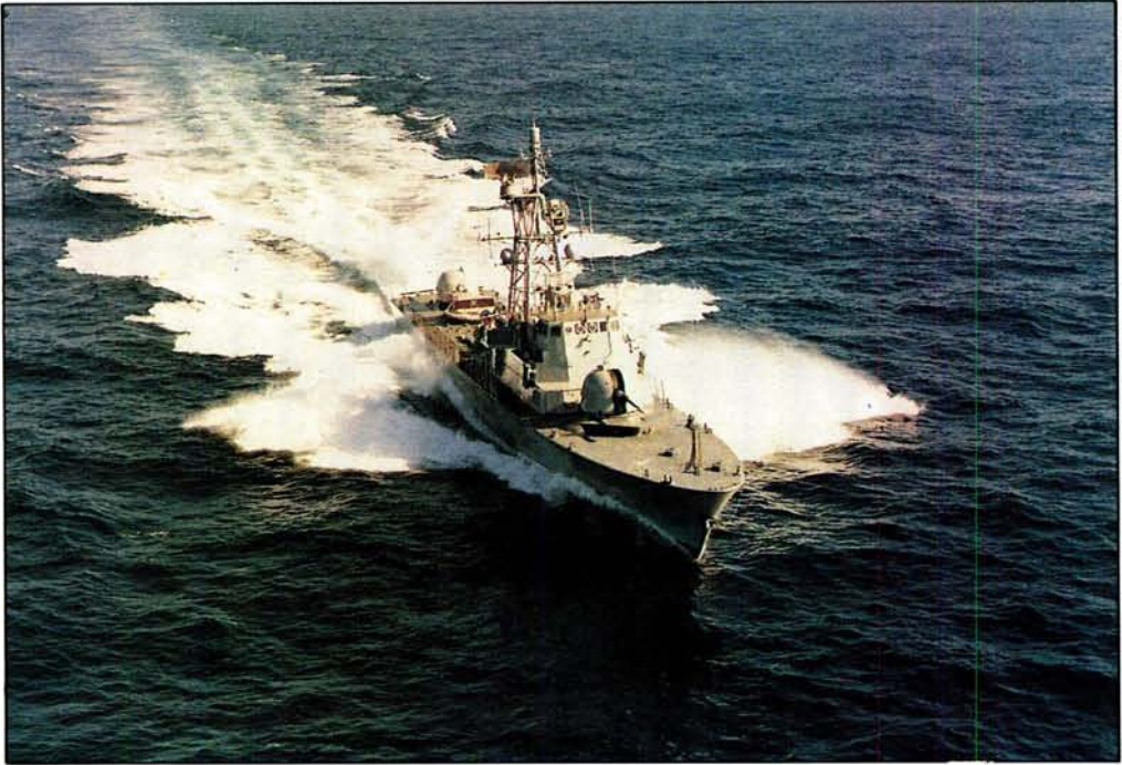
The SA Navy Strike Craft are named after previous South African Ministers of Defence.