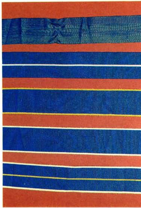
Ribbons of the Order of the Star of South Africa