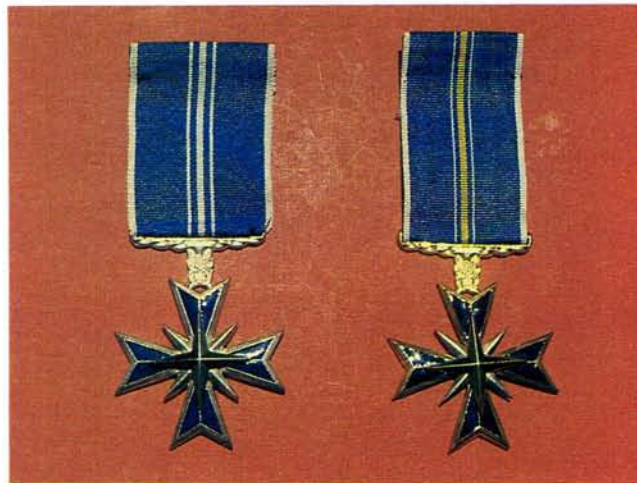
Order of the Star of South Africa