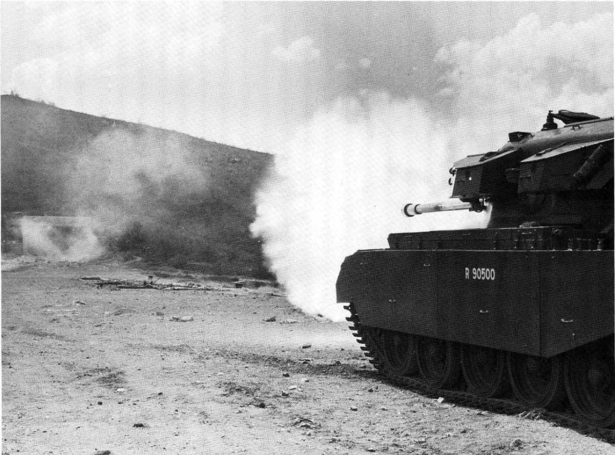
When a tank engages a target, many language communication processes precede the final command "Fire", from interpretation of the situation, solving the problem posed, to executing the task by firing at the target.

This leadership is maintained and perpetuated by the establishment of a Military Language Service in 1968. And over the years this language service expanded and developed into the largest such service in the country because the needs of the SA Defence Force in the field of language communication are so great. Official documents are translated, manuals, directives, speeches, press releases are issued in both official languages, language guides are compiled and distributed, thousands of members receive language instruction, immigrants learn Afrikaans and English, Black members learn the official languages, White members learn African languages and many members of the Defence Force learn languages such as French, German, Spanish, Portuguese, Hebrew, etc. In addition, the SADF Language Service liaises with all language bodies and authorities in an effort to improve the quality of language communication for the quality and effectiveness of the training, battle handling, liaison and intelligence depends largely on the effectiveness of our language usage. And obviously liaison with our multiracial population is done best by medium of their own languages. So the SA Defence Force helps to