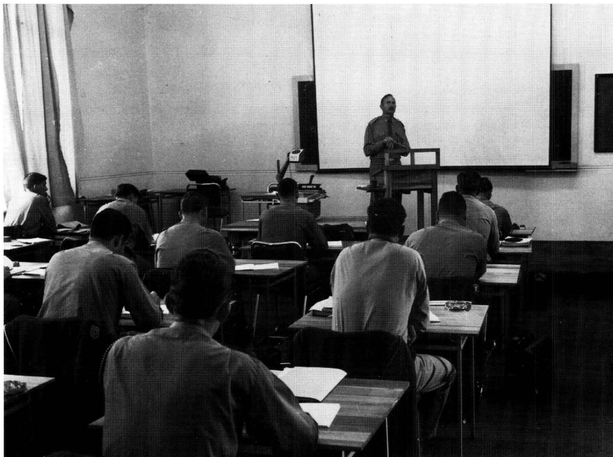
Although language training often takes place in the field or under operational conditions, classroom tuition, as in other non-language courses, remains essential.

From its establishment in 1912 to the present, in its seventy six years of existence, effective language use in both official languages, Afrikaans and English, has always played a main role. Indeed, it is incorporated in the provisions of Section 137 of the Defence Act, 1957 as amended. Certainly, orders, commands and instructions are conveyed by means of the spoken and written word. In terms of its language policy the SADF alternates the official language used in correspondence monthly, and lectures at its training establishments are presented alternately in English and Afrikaans. Hence the SADF may rightly claim the highest possible measure of bilingualism.