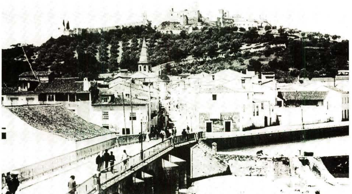
A panoramic view of TOMAR, where some of the Boer prisoners of war were held.