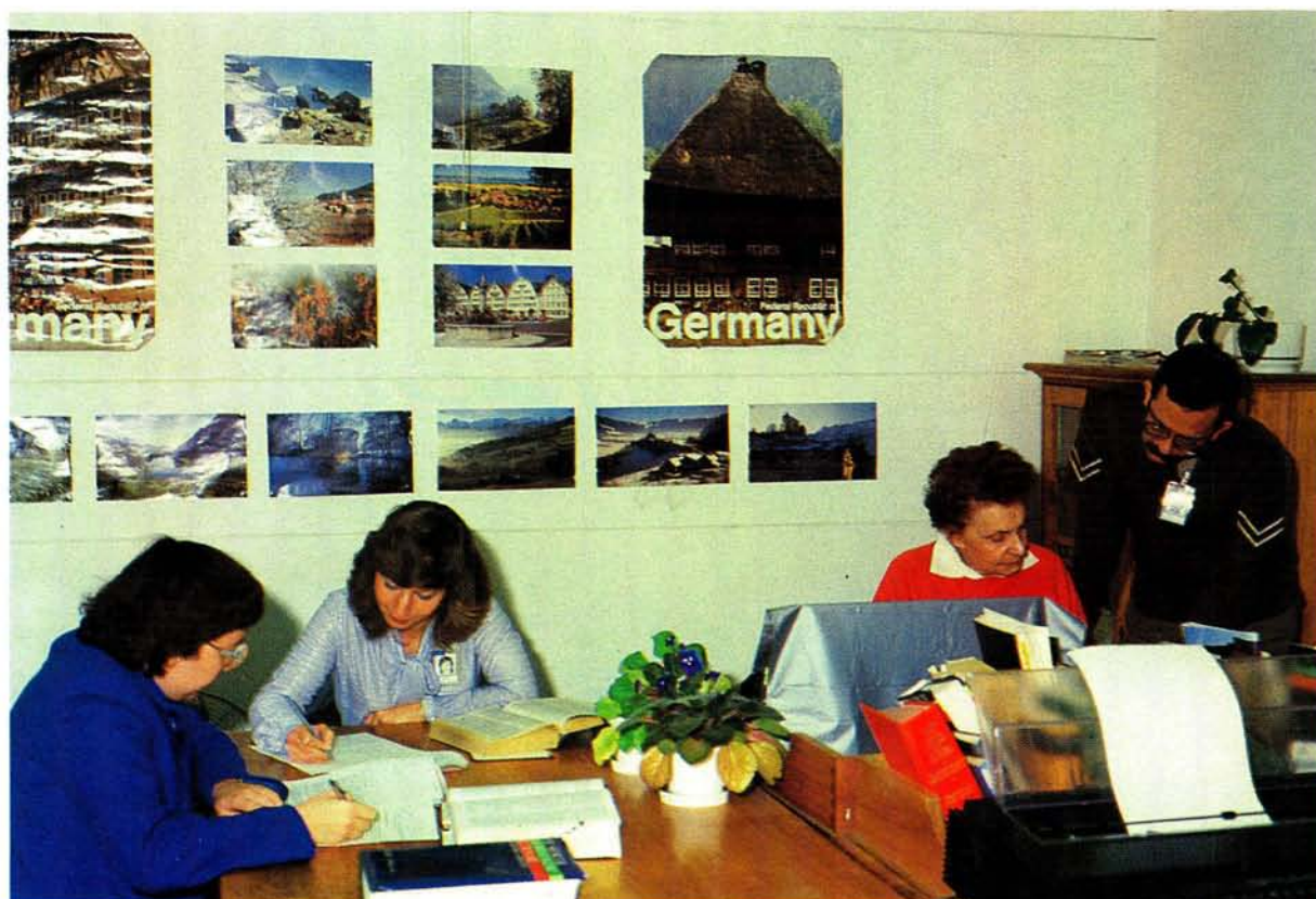
At the Foreign Languages Section translation and editing is done in, inter alia, French, Italian, Spanish, Portuguese, German and Russian.