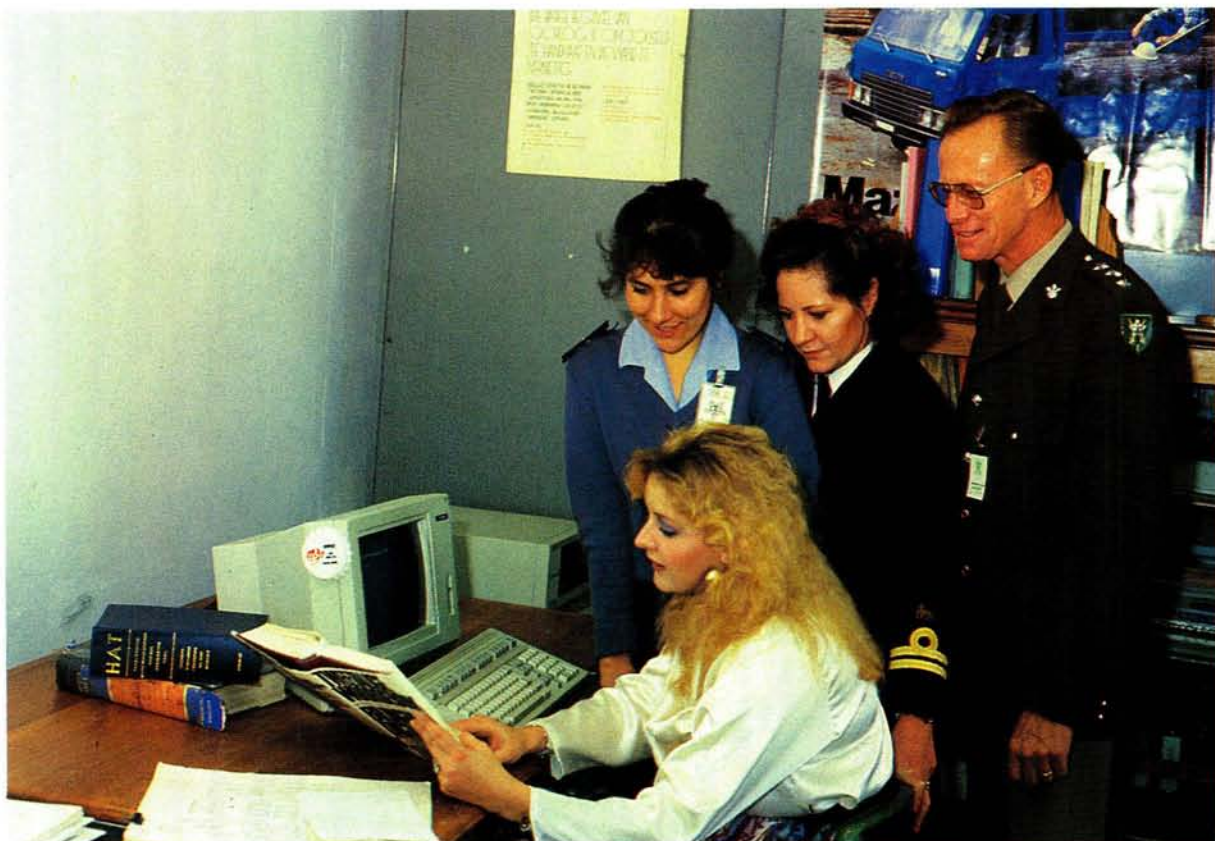
Language practitioners of the Official Languages Section gather around a colleague who is editing a document on a word processor.