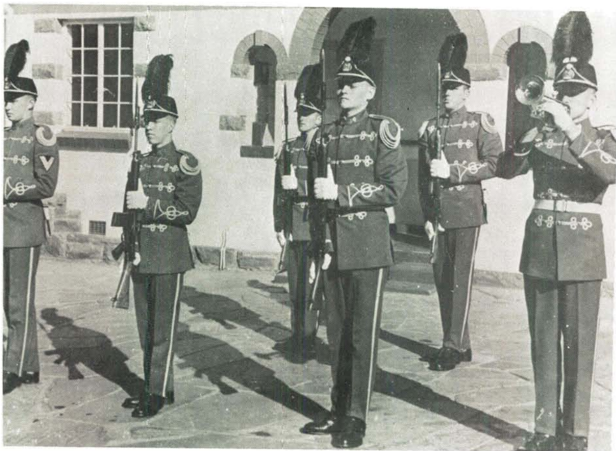
Wagwisseling van die Staatspresidentswag voor die Presidensie