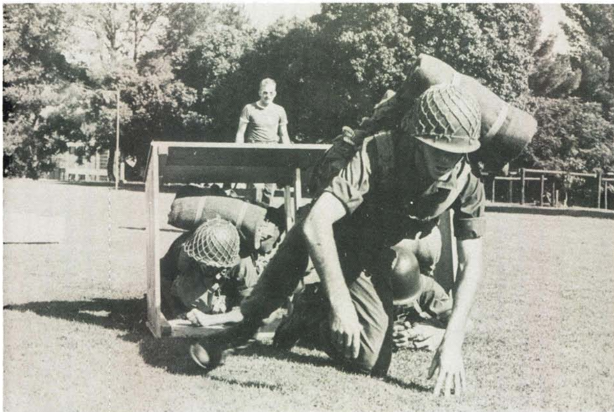
Hinderniswedloop van die SP Wag tydens opleiding An obstacle race: part of the training of the State President's Guard