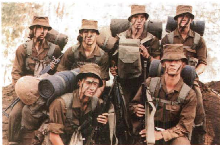
SP-eenheid dagkommando. Veldoefening by Doornkop.

State President's Unit day commando during a field exercise at Doornkop.