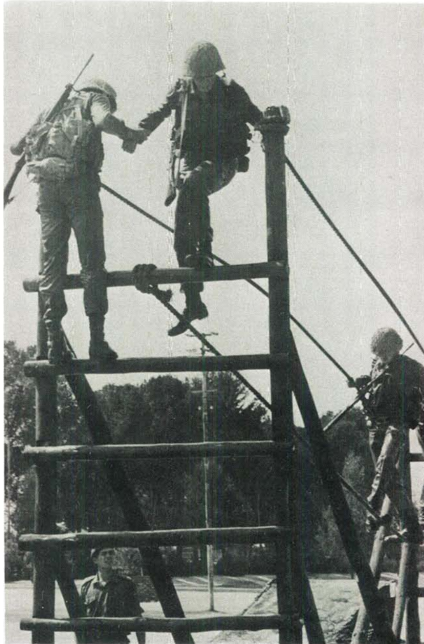
Tou-loop en pale klim tydens basiese opleiding Rope-walking and pole-climbing during basic training

the State President's Unit are demanded. These include an average of 190 points in the Chief of the Army's shooting competitions; a fitness standard of 75%; a maximum number of accident-free kilometres; irreproachable loyalty towards the SADF; and a high standard in ceremonial work.