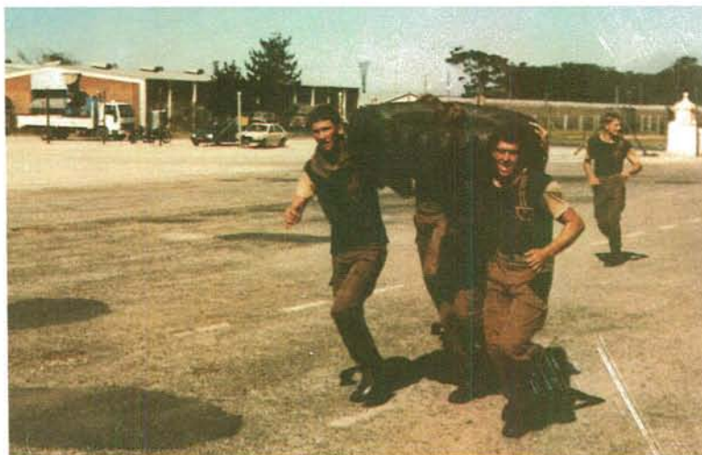
Draf met buiteband tydens opleiding.

Mealtime during the Unit's field exercise.