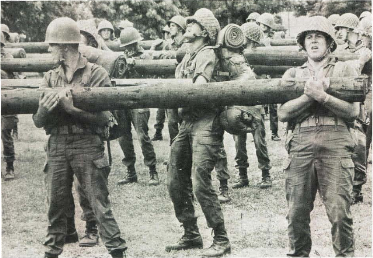
Oefening met pale deur lede van die SP Wag Members of the State President's Guard exercising with poles