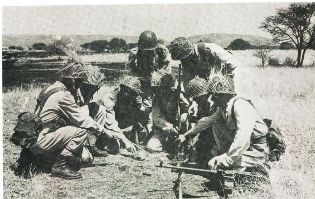
Veldopleiding van die SP Wag The State President's Guard undergoes field training