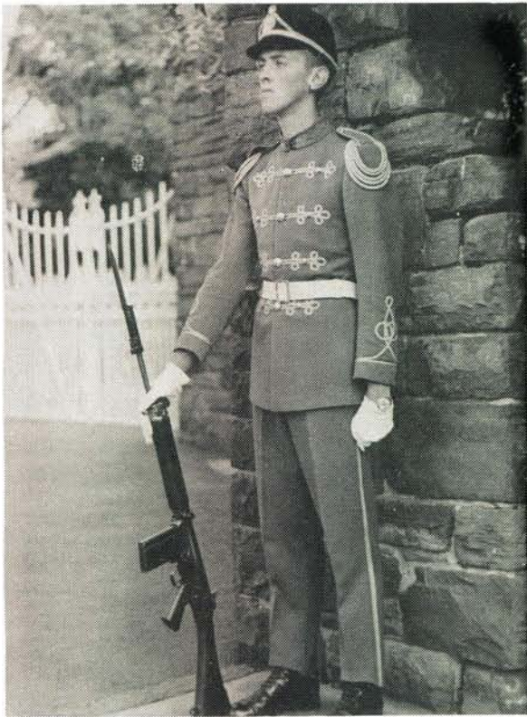
Staatspresidentswag by die Kerkstraathek van die Presidensie waar al die vroeëre Presidente tuis was

However, upon investigating the training they receive during National Service, one soon changes one's opinion. The sentries are trained as soldiers who can protect their country against attacks from the outside, as well as against internal unrest. The ceremonial function is also of great importance and a high standard of training for the Unit, as home guard and as guard of honour, is maintained.