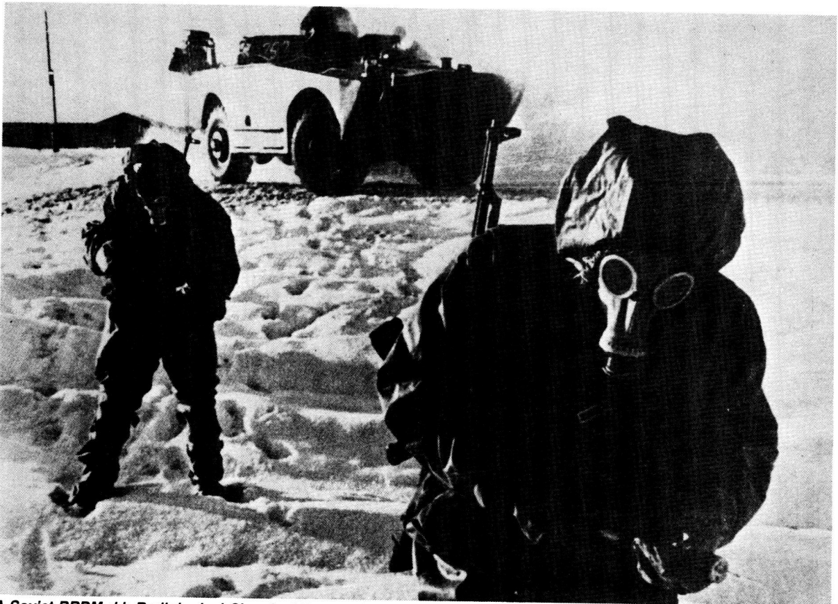
A Soviet BRDM-rkh Radiological-Chemical Reconnaissance vehicle with area warning emplacements. The vehicle explores the boundaries of an infected zone and marks the limits.

Soviet forces were directly involved. 6 This would appear to have been a small-scale feasibility study to obtain hitherto unavailable data. After 1977, a second stage was launched. It was now possible to formulate strategy and tactics for the use of new chemicals specifically belonging to the trichothecene group of compounds. It is interesting to note that an East German military manual dealing with the general tactics used to deliver mycotoxin weapons (i.e. trichothecenes), dates back to 1977. 7 After this date, Soviet jet aircraft (as well as the slower Antonov-12) were used against the Hmong tribesmen.