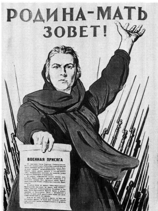
3. "YOUR MOTHER COUNTRY APPEALS TO YOU" Russia. (1941)