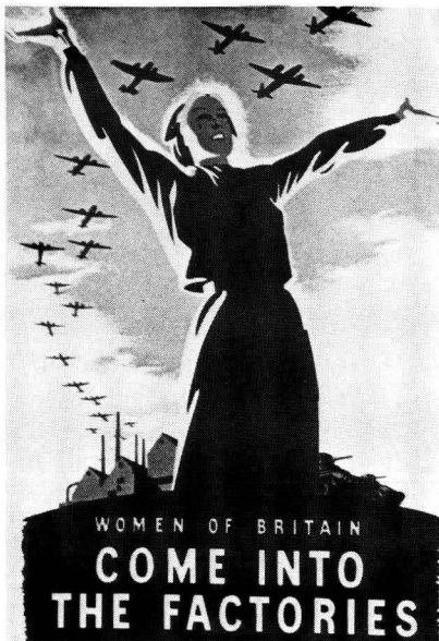
7. "WOMEN OF BRITAIN" Great Britain

In a war in which civilians could change place with soldiers at short notice, the link between the home front and the military fronts were very close. In any case, the distinction between the civilian hinterland and the front line was blurred because many towns and industries of the nations at war were within reach of enemy bombers.