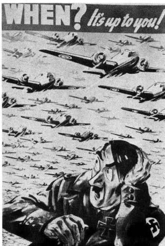
5. "WHEN? IT'S UP TO YOU" Great Britain