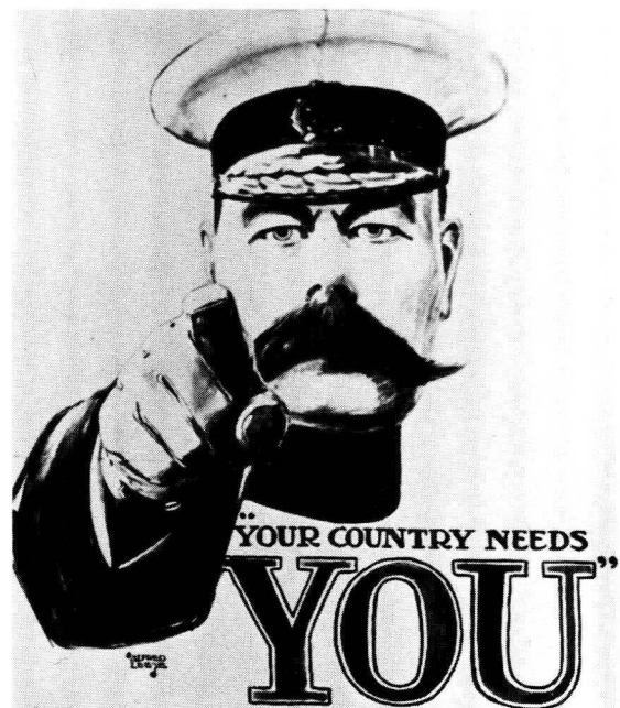
237 ALFRED LEETE Your Country Needs You 1914