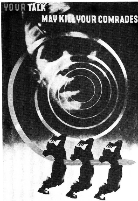
9. "YOUR TALK MAY KILL YOUR COMRADES" Great Britain

If the government sees the state as being beleaguered by enemies, external or internal, it then has to take appropriate measures. These include intelligence and internal security organizations, secret police etc. Thus a need for a type of poster that made appeals on behalf of military or war-industry security which concentrated on the enemy 'within', encouraging a mild form of mass paranoia – the feeling that the state was being besieged from within. Most of the national security posters were concerned with the effect of information leakage on the military effort.