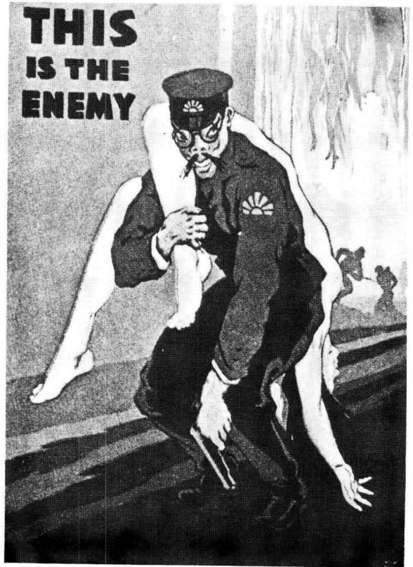
11. "THIS IS THE ENEMY"

In the two World Wars posters used the atrocity theme frequently; the enemy was inhuman, brutal and could not be trusted to behave in a humanitarian manner. For example a quote by Hitler; 'one is either a German or a Christian . . . you cannot be both', has been used in the British