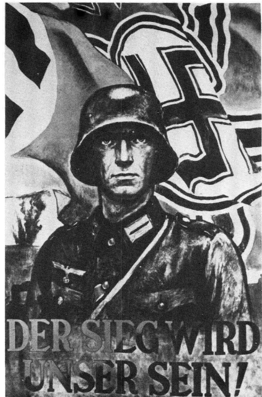
2. "VICTORY WILL BE OURS" Germany. (1942)