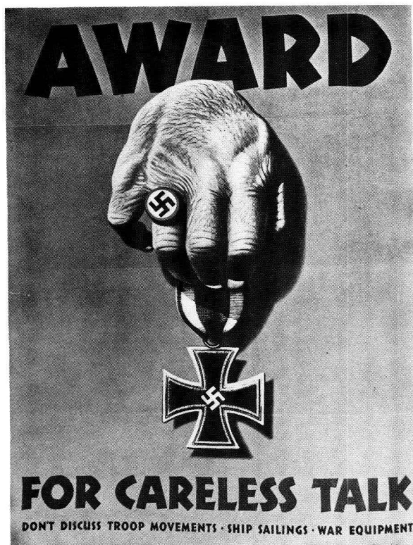
8. "AWARD FOR CARELESS TALK" U.S.A.