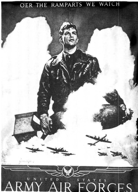
1. "O'ER THE RAMPARTS" U.S.A. (1944)

The posters in this category, produced by the four major warring protagonists either aim at a direct recruitment of men for the war effort or, (in