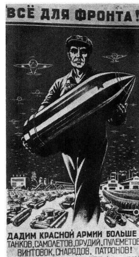
6 "EVERYTHING FOR THE FRONT" Russia