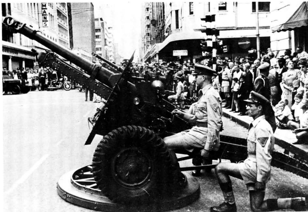
Transvaal Horse Artillery.

THA – all that remained of the many volunteer gunner units – as 6th, 7th and 8th Citizen Batteries respectively. The 3rd and 5th Batteries were not formed and when war broke out in 1914, 1st Battery personnel were used to fill the 2nd and 4th. Three other batteries – 9th, 10th and 12th – were raised for the campaign in German South West Africa, all men in the S.A. Police who had artillery training being allowed to volunteer into the S.A. Artillery. In addition to the field batteries, a Brigade of Heavy Artillery was formed at Cape Town which rose to a strength of 60 officers and 1000 other ranks before the close of the S.W.A. campaign. Men were drawn from the Royal Marines, Royal Garrison Artillery, the Cape Garrison and Durban Garrison Artillery and three Brigades were eventually formed. Later, from these Brigades and other volunteers five Heavy Batteries, 1st to 5th Siege Batteries were formed for service in France. Only men of fine physique and of a standard height of 5 feet 8 inches were accepted.