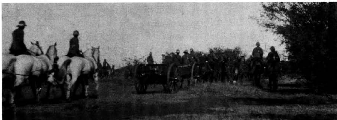
Transvaal Horse Artillery.

By 1935 the title was 1st Field Battery, S.A. Artillery, changed in 1940 to 10th Field Battery, 4th Field Brigade and during the Italian Campaign of 1944/5 it became 4/22nd Field Regiment, S.A.A.