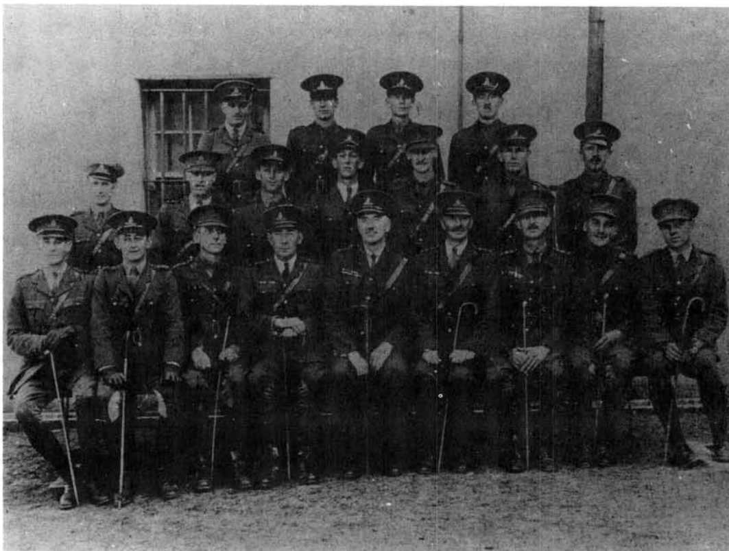
Officers: SA Garrison Artillery.

In 1923 the S.A.F.A. returned their 13-pounders to store and were issued with 4.5 inch Howitzers for 1st Battery and 18-pounders for 2nd and 3rd Batteries. The howitzers were the guns used by the original S.A.F.A. in Palestine in World War I and still had the "Key to Jerusalem" painted on their shields. These were carefully and faithfully repainted each time the guns were repainted, right up till 1940. The S.A.F.A. Brigade survived until 1926 when the 3 Batteries became independent units.