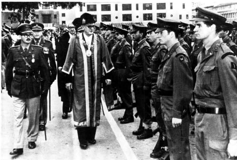
Cape Field Artillery.