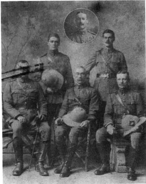
Prince Alfred's own Cape Artillery.