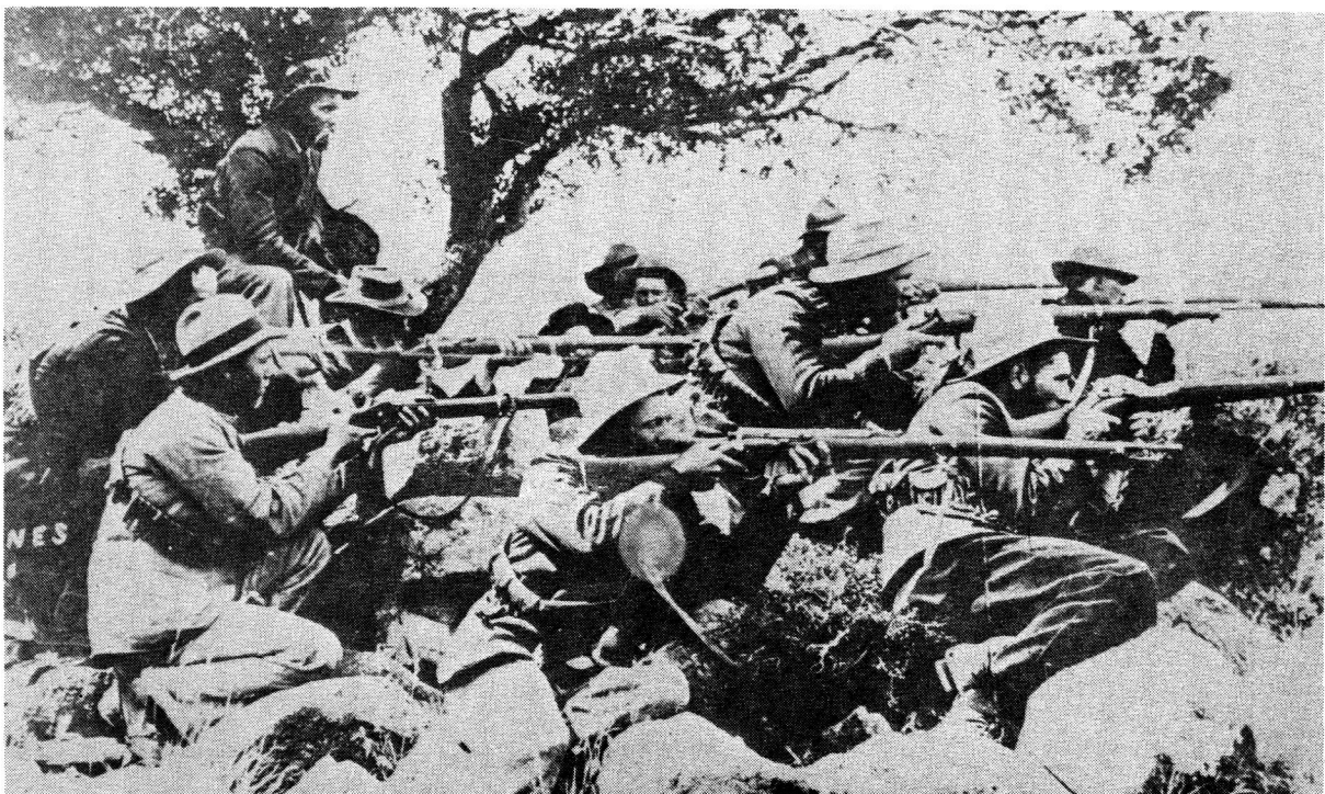
Boer Sharpshooters distinguished themselves as excellent shots during the Anglo-Boer War

During the Anglo-Boer War of 1899–1902 our forces, for more than three years, held at bay the most powerful Empire the world has yet seen. We did so because we could outshoot their troops and out-general their generals – and because in the 7 mm Mauser rifle, even without benefit of telescopic sights, we had the advantage of a superbly accurate, flat-shooting weapon. Had this not been the case, the war would have ended for us in ignominy and disaster. Our ability to use the rifle as it should be used spared us from ignominious defeat and preserved our pride. It also paved the way for eventual political victory.