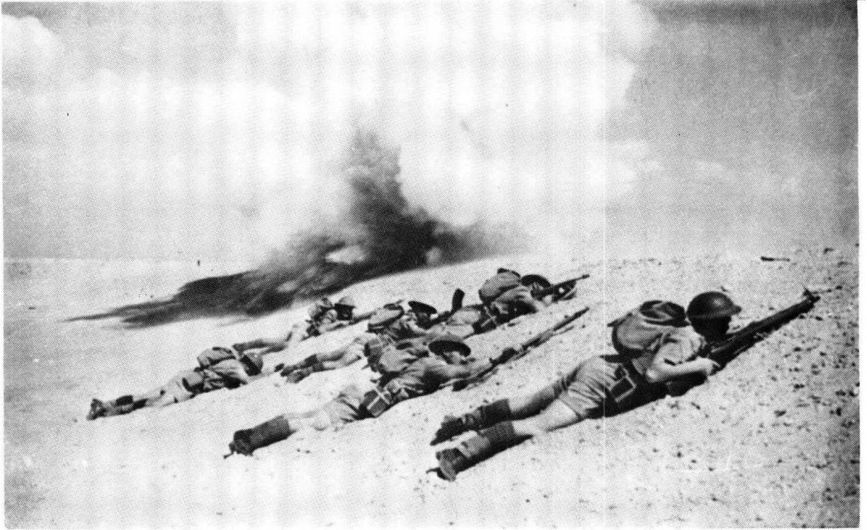
Training, North Arica, World War II

In November 1941 1 SA Division and 2 SA Division went onto the offensive with the British Eighth Army. Expectations were high, and at first rewarded with success. Rommel was forced to withdraw. The South Africans took Bardia and Sollum. The sweetness of victory turned sour, however, when the 5th SA Brigade was annihilated by German tanks at Sidi Rezegh. Rommel retreated and then launched a counter-attack which forced the Eighth Army back to Gazala. 29