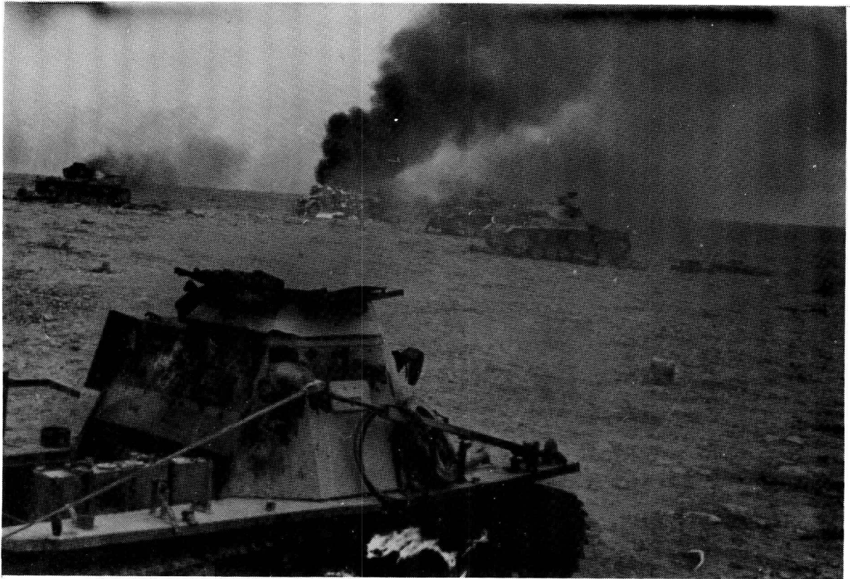
Tanks in the Western Desert, World War II