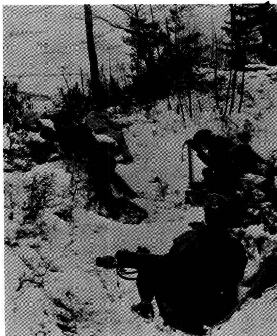
Italy, December 1944. South African troops prepare for action in the snow-covered Appenines

In 1944 the Polish resistance rose against their oppressors, confident that the 'Russian steam-roller' would assist them. The Russians did not act; consequently the Germans moved in and