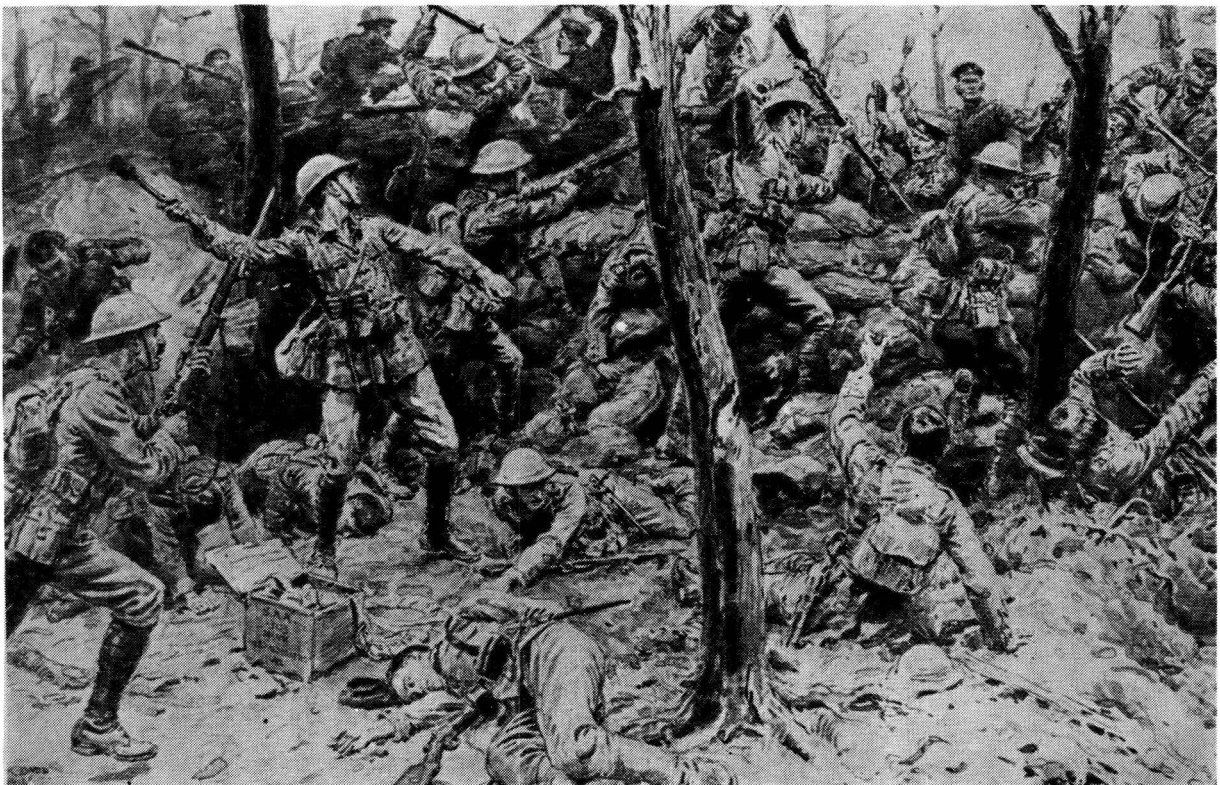
The Battle of Delville Wood, July 1916.

On the morning of 14 July 1916 the 26th and 27th Scottish Brigades attacked Longueval and Delville Wood. However, the German defenders refused to give ground, and bitter hand-to-hand fighting ensued through Longueval. By the afternoon the town had still not been taken entirely. 11 The Scots suffered heavy losses.