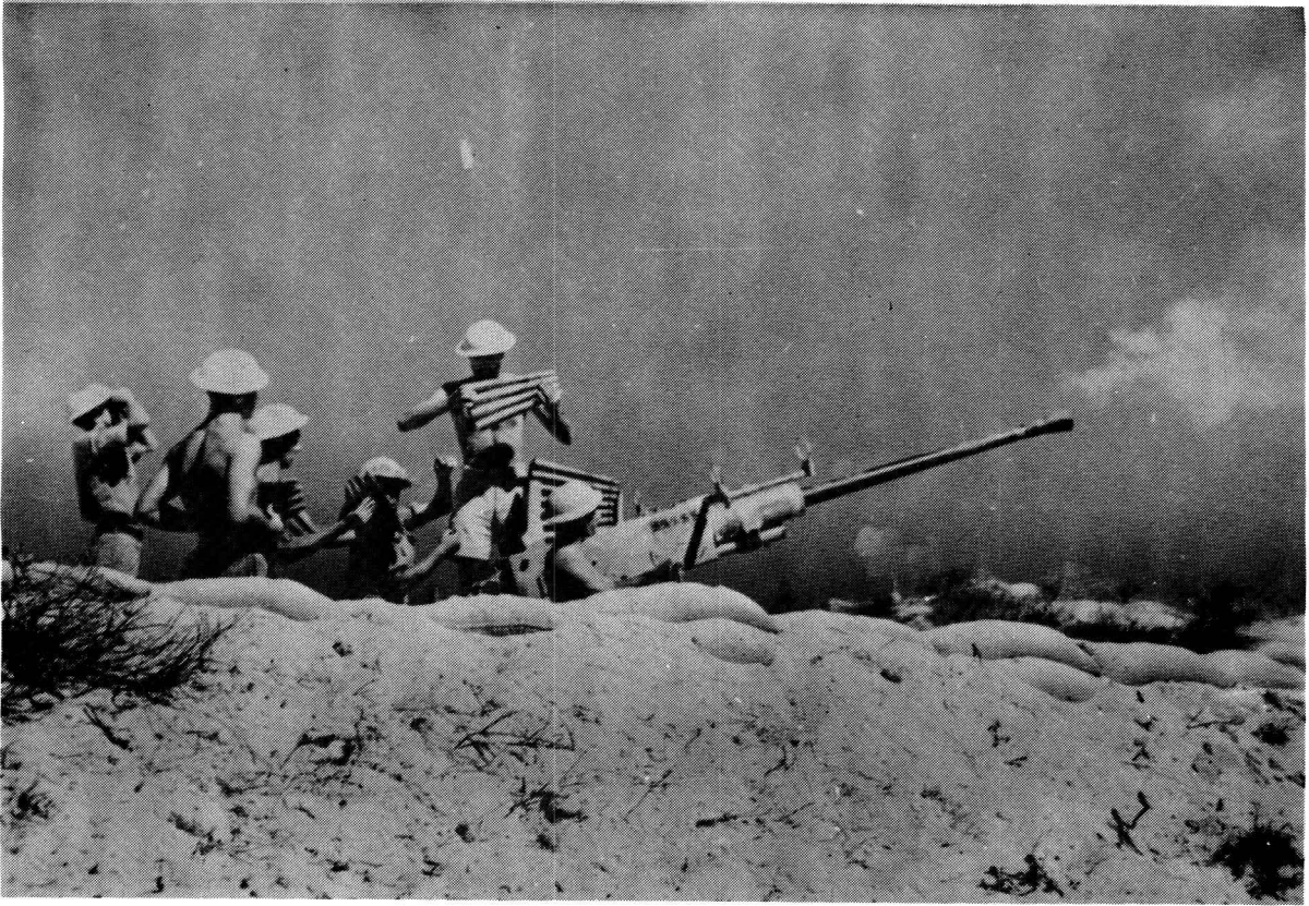
Bofors Gun in the Western Desert, World War II