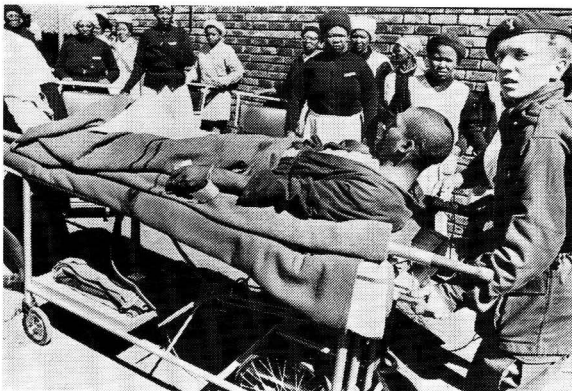
Patient transferred from one hospital to another by SA Medical Corps.

Armed forces have similarly shown that they can perform valuable work in the field of medical care. In a standing army, this role may be limited by the fact that only sufficient medical personnel are recruited to deal with members of the military, not with civilians as well. With a force that is composed partly of conscripts, it is possible that a more extensive role can be played, since more medically trained personnel may be available. Firstly more trained doctors may be conscripted than are necessary to deal with the needs of the military personnel. Secondly usually sufficient conscripts are trained in basic medical skills to enable the armed forces to cope with wartime conditions, and so these personnel are considerably under-utilised in peacetime.