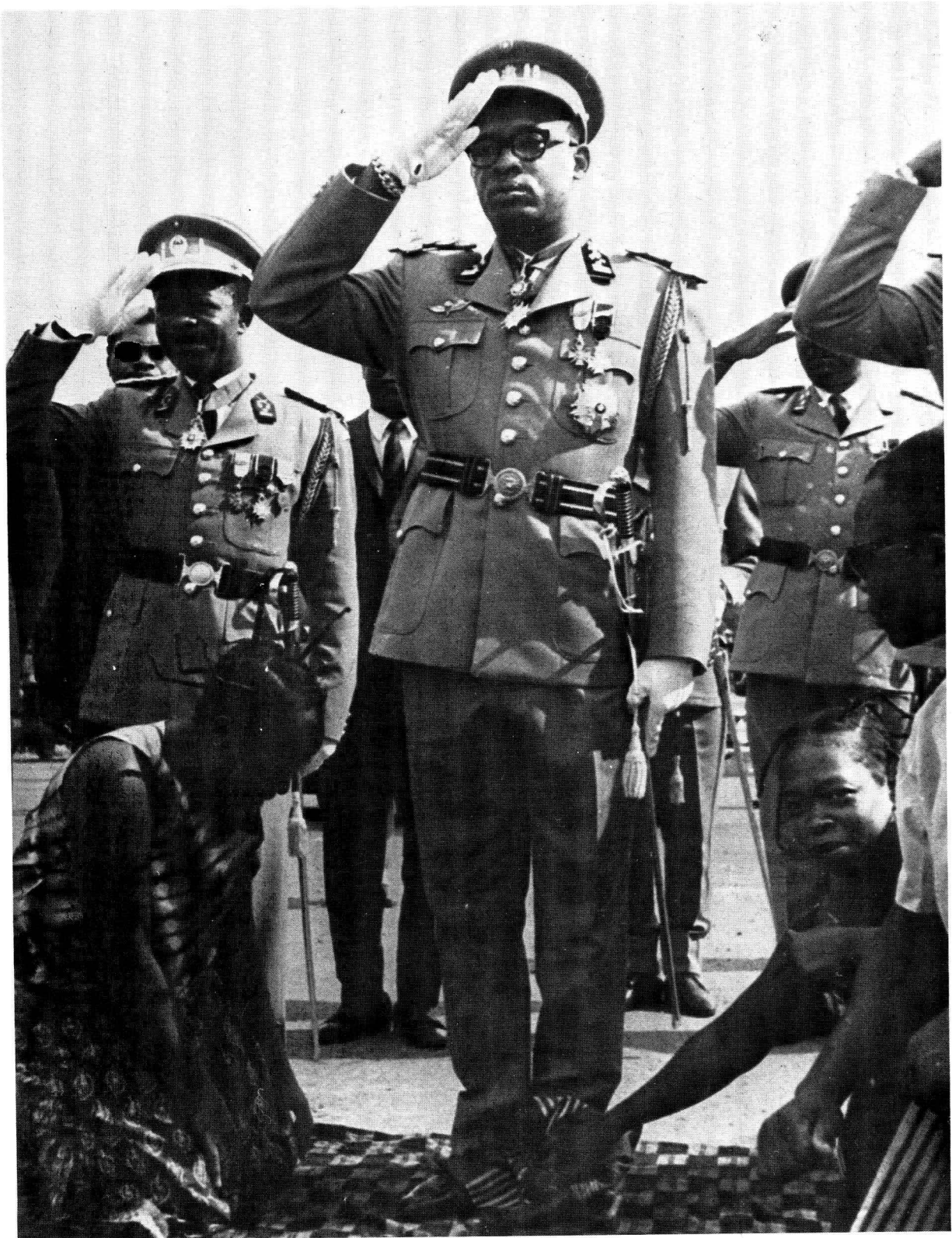
President Mobutu se Sekako of Zaire.