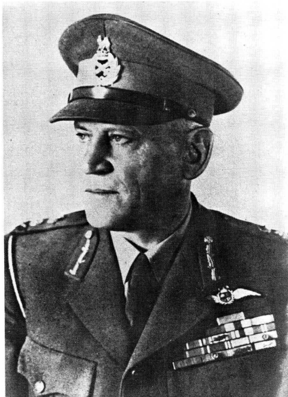
Sir Pierre van Ryneveld former Director of Air Services.

land forces and to receive artillery instruction. 7