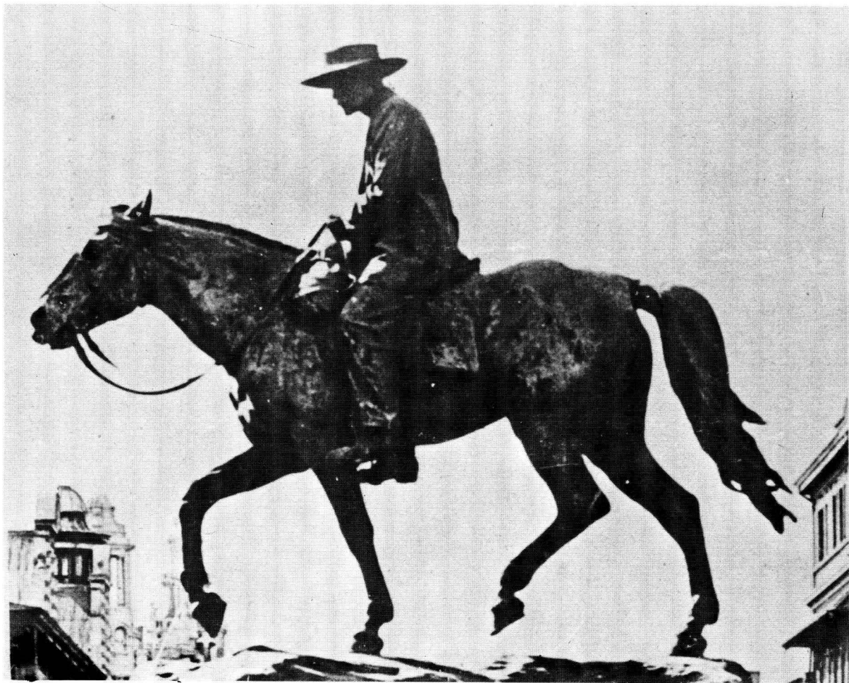
A monument to man and horse commemorating Dick King's epic ride and emphasising the vital role which the horse has played in our military history.

The British Army towards the end of the last century had a healthy regard for this factor, and regarded the Transvaal with particular caution as an area of potential death to their horses. The official view was that 'the principal causes of mortality among them are two-fold, the attacks of the Tsetse-fly and the malady known as horse-sickness ... The ravages of this singular insect (the tsetse-fly) are so deadly as to render impossible the employment or existence of horses or cattle wherever it exists.' 21 It was these demanding conditions in South Africa that led to local horses, though often considered hacks, to outlast expensive imported horses.