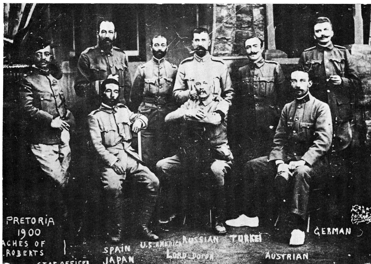
The military attachés with the British army in South Africa, photographed in Pretoria during January or February 1901 (not 1900)

Besides the above mentioned envoys there were more: on 22 February, after Lord Roberts' refusal to send Cronjé doctors on his terms, the latter again asked not only for doctors, but for a hospital to be sent to him — without changing his original conditions of keeping the doctors till the end of the siege. Naturally Lord Roberts refused. On 23 February Lord Roberts dispatched someone to find out the number of English prisoners in the Boer camp. Cronjé sent him a list of names (16 men). Lord Roberts made him the proposal to exchange prisoners. Cronjé agreed and the exchange took place... We see from the above that there was daily intercourse between the besieged and the besiegers. Many of these must be acknowledged to be quite superfluous — that is if other secret negotiations were not taking place at the same time. It is also very odd that Cronjé agreed to the exchange of prisoners — for by doing so he was revealing camp conditions and the defence situation.