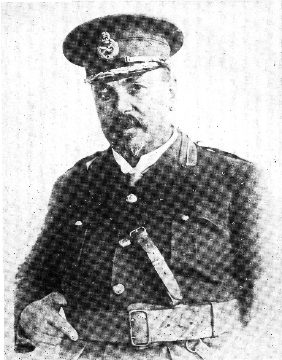
Genl Louis Botha, C-in-C of the Union Forces in German South West Africa.

The 2nd and 4th ( Permanent ) Batteries, the